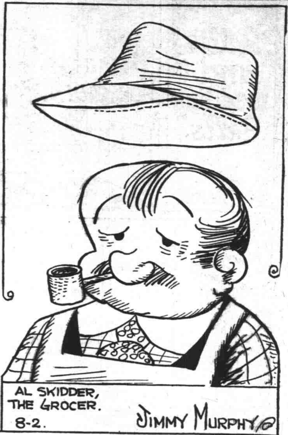
AL SKIDDER, THE GROCER. 8-2.