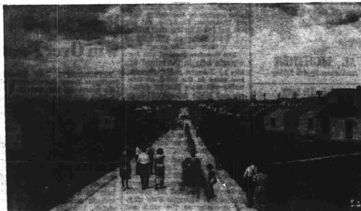
LIDICE REBORN —This housing community near Joliet, Ill., was named Lidice in memory of the Czechoslovak hamlet which was razed by the Nazis as a reprisal measure.