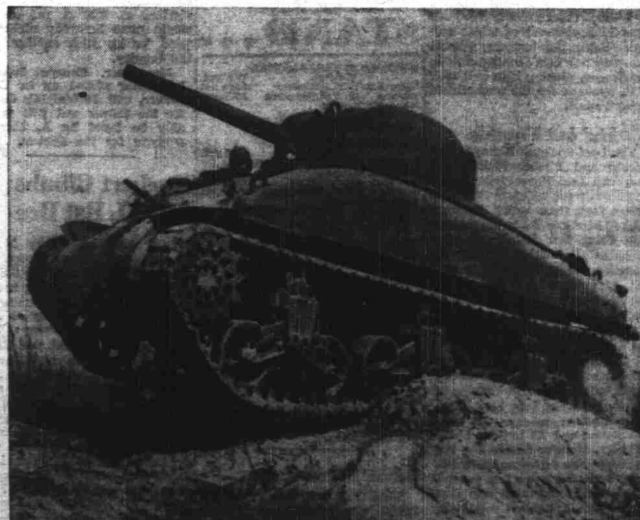
STREAMLINED —This is Uncle Sam's new and improved M-4 tank. Lower silhouette and no abrupt angles make it a more difficult target. Turret holds a 75 mm. gun.