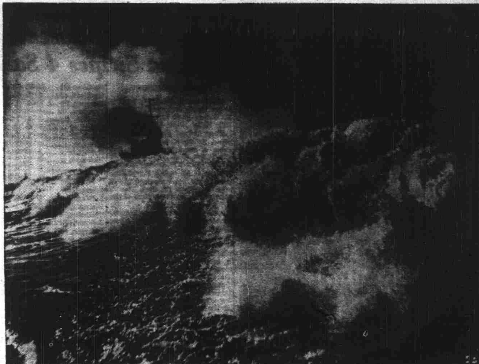
MEDITERRANEAN GETS TOUGH —Not only do United Nations sailors face the menace of Axis submarines, mines, torpedo boats and airplanes in the Mediterranean. The old sea itself is sometimes a foe. Here British destroyers race through heavy seas.