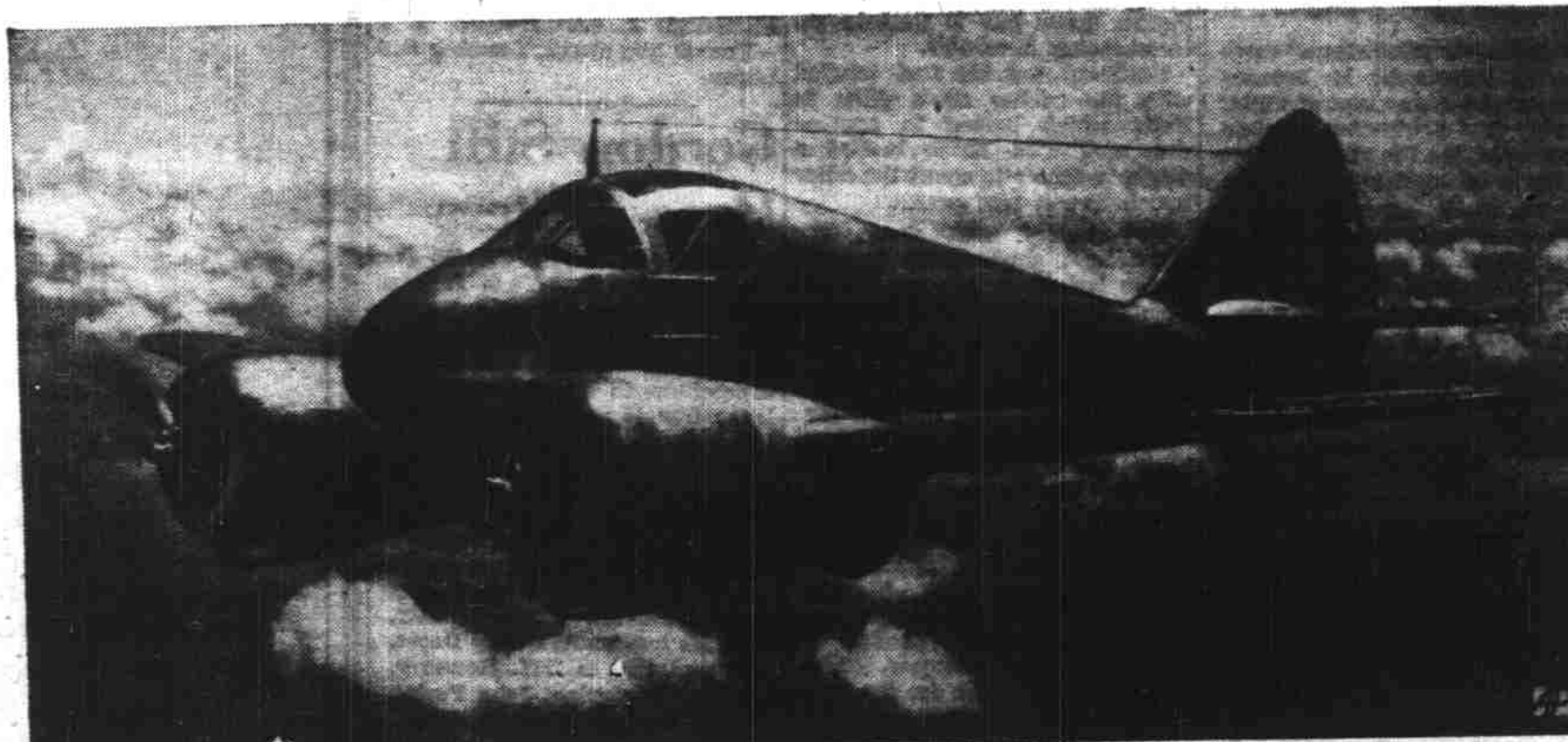
TRAINER FOR BOMBER PILOTS —An AT-9 twin-motored advanced training plane soars over Ellington Field, Texas. These craft have flying characteristics similar to those of giant bombers that the pilots will fly upon graduation from training courses.