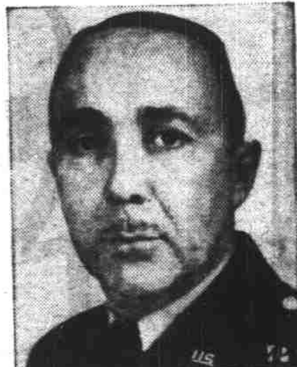
SIGNAL CHIEF —Major Gen. Dawson Olmstead (above) is commander of the United States Army Signal Corps.