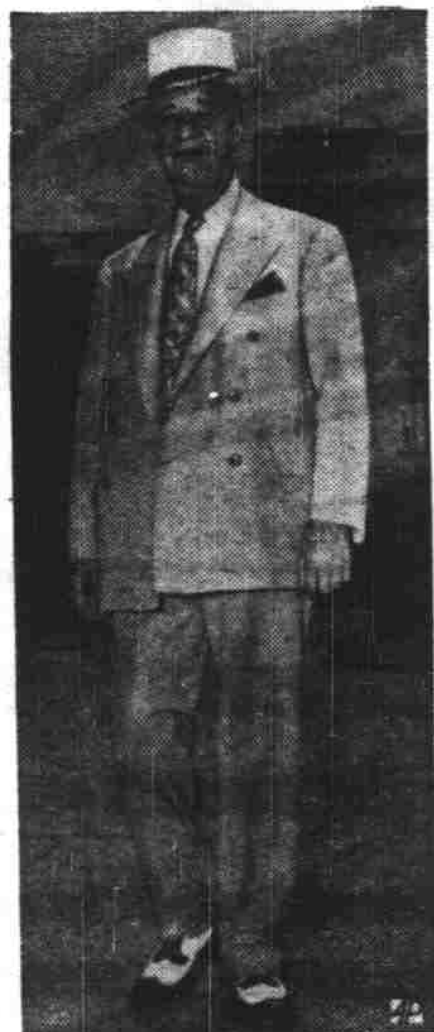
SAYS 'NO' —As Al Smith (above) left the White House reporters asked him if he might seek the New York governorship. The Happy Warrior answered "No, no and no."