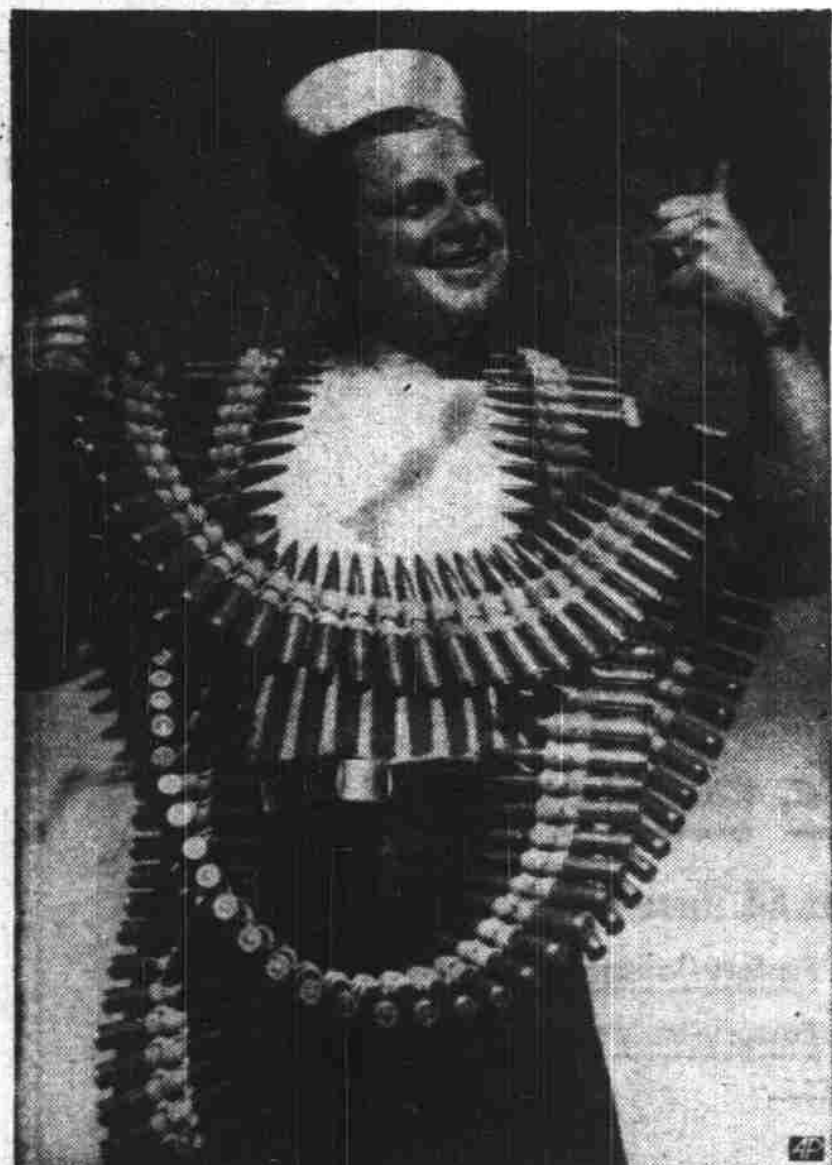
THUMBS UP —This husky Coast Guardsman wrapped in a bandolier of bullets indicates he is ready to take it and dish it out.