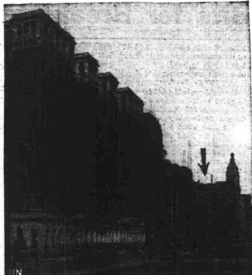
Two of Chicago's most famous hotels, the Stevens, considered the world's largest hotel, and the Congress, will be taken over by the federal government for "military or other war purpose." Aug. 1. The Stevens, left, has 3,000 rooms. The Congress, right, has only 900 but has played host to presidents, opera stars and other celebrities for years. The government will rent the hotels, not purchase them. The hotels are on Chicago's famous Michigan boulevard.