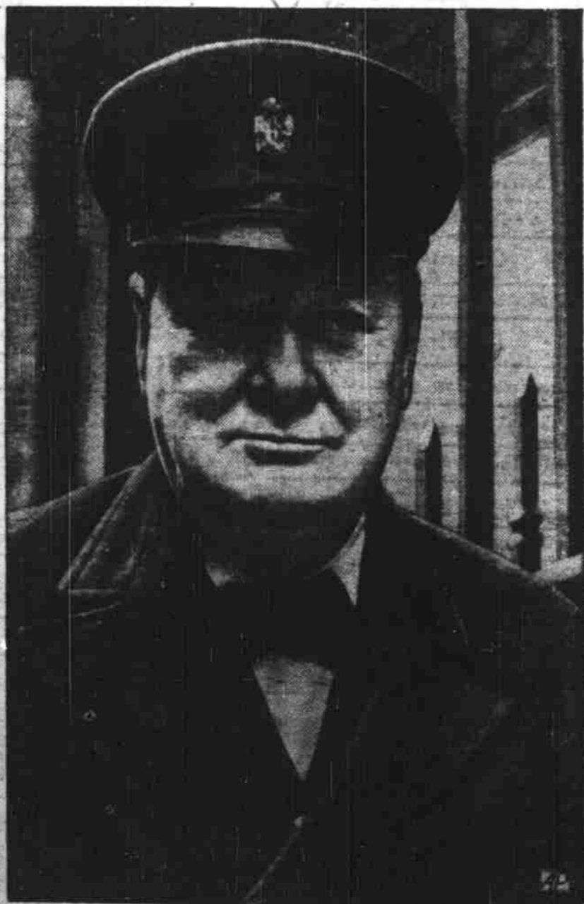
CLOSEUP —This interesting closeup photograph of British Prime Minister Winston Churchill was made after the famous leader and orator returned to No. 10 Downing Street in London following his latest visit to the United States. He wears his familiar yachting cap. Churchill returned to face bitter criticism because of British reverses in Libya but won a vote of confidence.