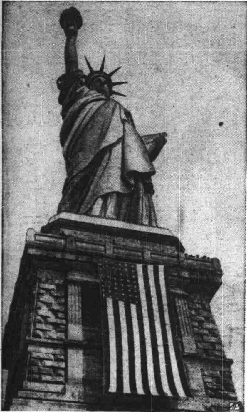
MISS LIBERTY AND OLD GLORY —Beneath the lowering Statue of Liberty hangs the Stars and Stripes of the U.S.A.