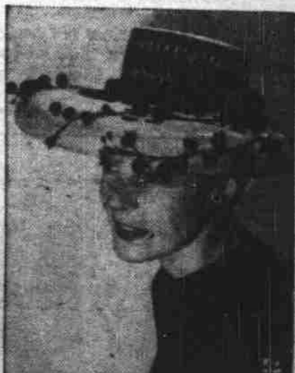
LAMP SHADE —A New York designer molded pale Virginia blue felt into this attractive lampshade hat.