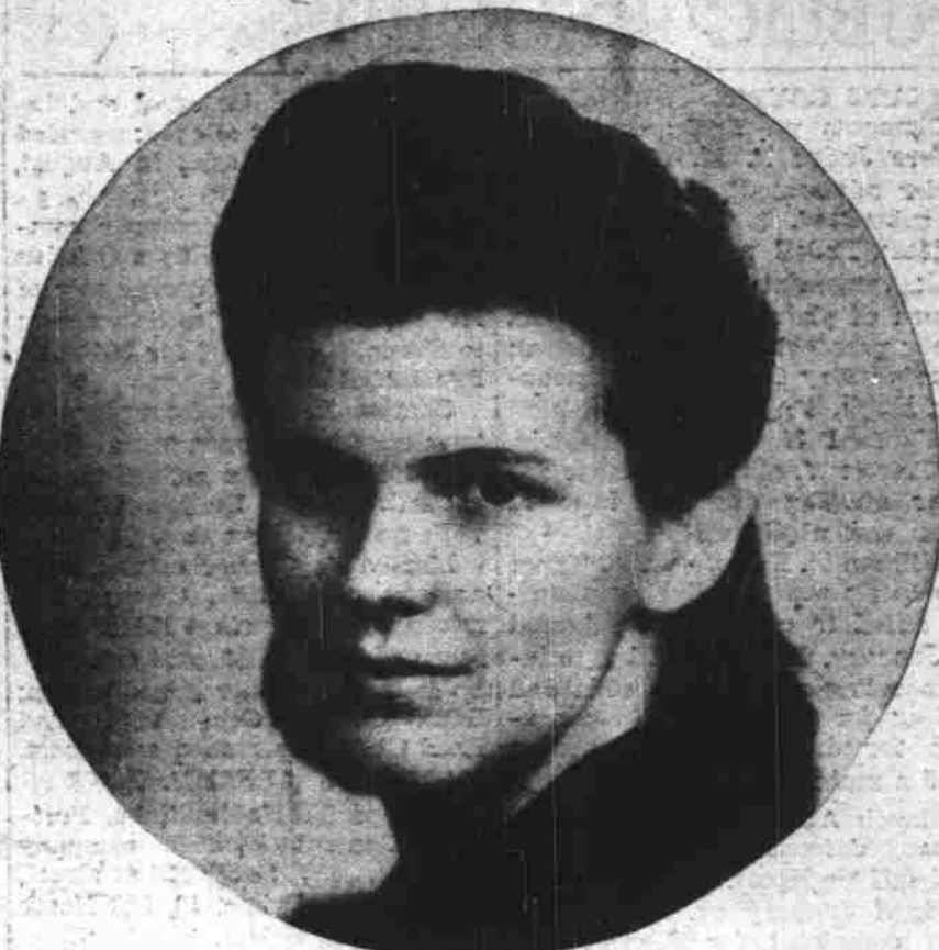
Tells wedding day ...