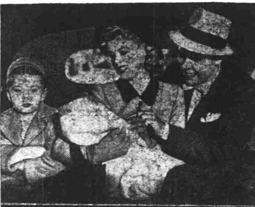
BABY DUMPLING, Cookie, Blondie and Dagwood (from left to right) as portrayed by Larry Simms, Penny Singleton and Arthur Lake in "Blondie's Blessed Event," now showing at the Grand theatre. Second feature is "Canal Zone," starring Chester Morris, John Hubbard and Harriett Hilliard.