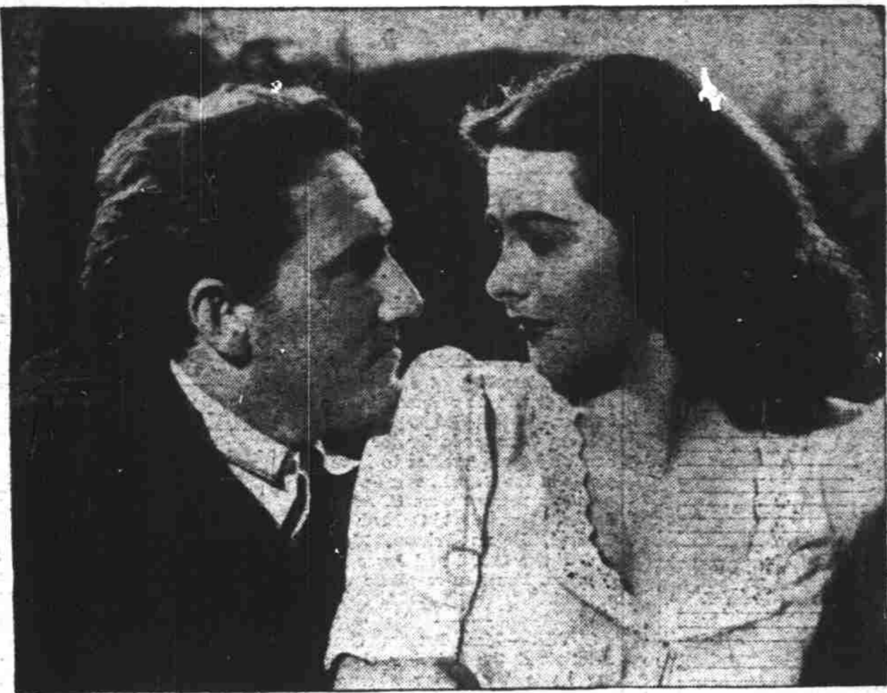
ONE OF THE screen's most dynamic actors and one of its loveliest actresses appear together in "Tortilla Flat," in the persons of Spencer Tracy and Hedy Lamarr. Playing the role of Pilon, the colorful rascal of John Steinbeck's story is Tracy while Miss Lamarr fills the role of "Sweets" Ramirez. Third star in the east is John Garfield. The companion feature is "Remarkable Andrew" with Brian Donlevy and William Holden.