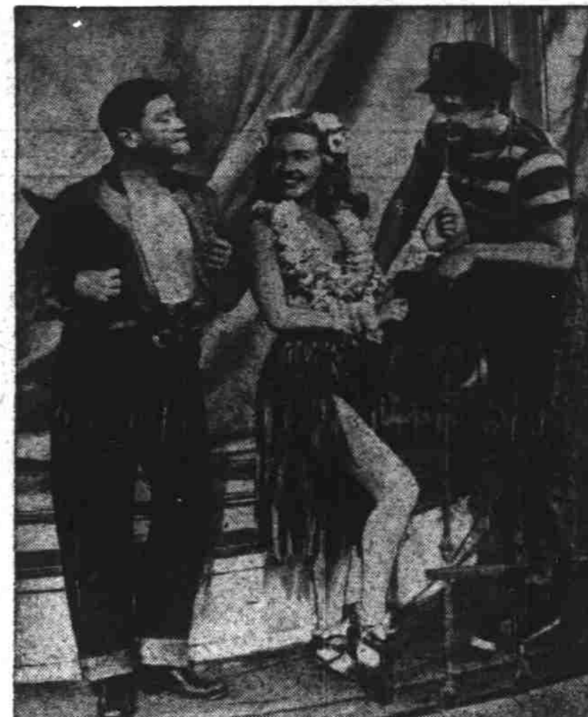
JACK OAKIE SEEMS to know what he's bragging about to Betty Grable and Vic Mature in this scene from "Song of the Islands," now playing at the Capitol theatre. "All Through the Night" with Humphrey Bogart.