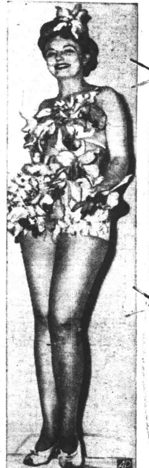
ORCHID QUEEN —Doris Webb, 22, of Jacksonville, Fla., displays an orchid corsage of super de luxe proportions at the annual Florida State Florists' convention at Orlando, Fla.