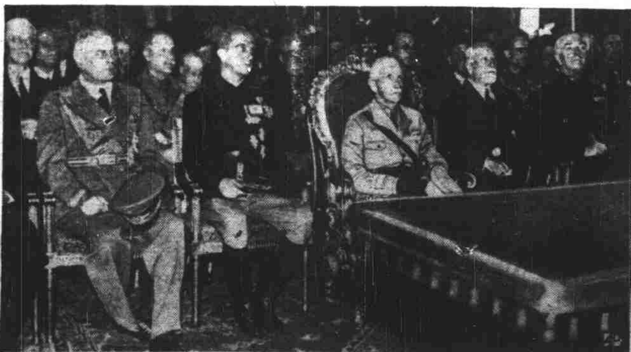
KING VICTOR EMANUEL ATTENDS —His Majesty King Victor Emanuel of Italy (seated, third from left) attended extraordinary meeting of the Royal Academy of San Luca in Rome.