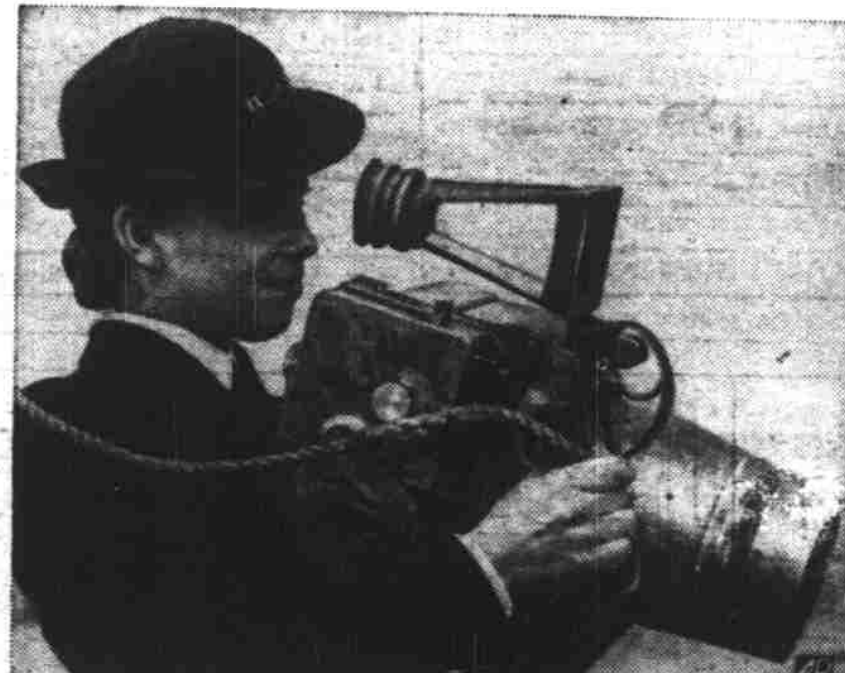
CAMERA WOMAN —As part of British women's war training to free men for fighting, this woman studies aerial camera.