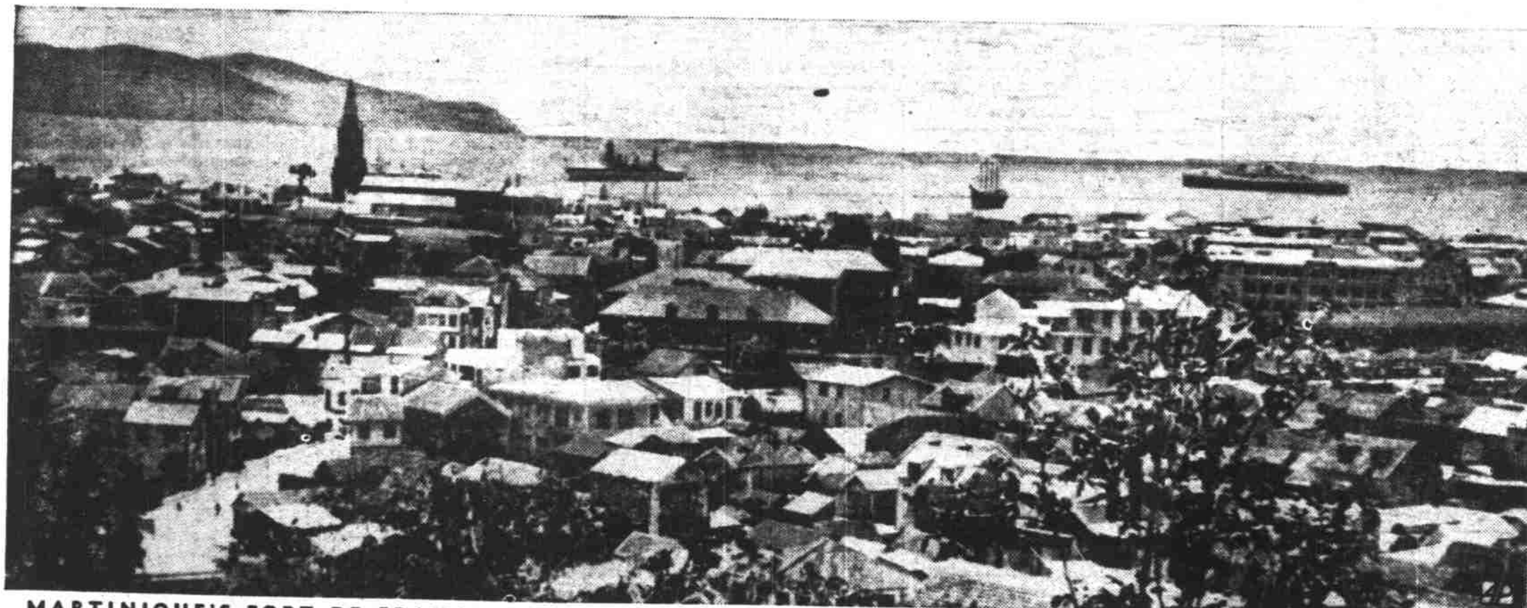
MARTINIQUE'S FORT DE FRANCE —This is a view of Fort de France, Capital of Martinique, Vichy French colony in the West Indies. Ever since the fall of France anti-Axis powers have eyed suspiciously this city with its fine harbor defended by three forts. The status of French warships there has been an issue.