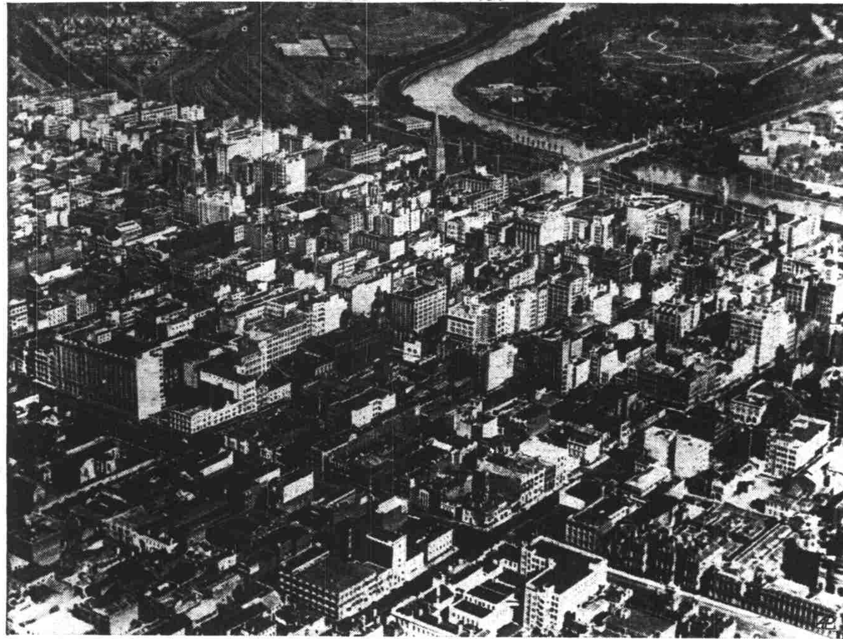
MELBOURNE, MODERN AUSTRALIAN CITY —This airview shows the modern character of Melbourne, capital of the state of Victoria in Australia. Located on the southeastern coast, the city has a population of 1,046,750. Its climate is temperate.