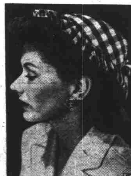
SUNBONNET —Here is a pompadour bonnet of blue and white check gingham. The earrings of diamonds are set with sapphires and gold, representing a bunch of wild flowers.