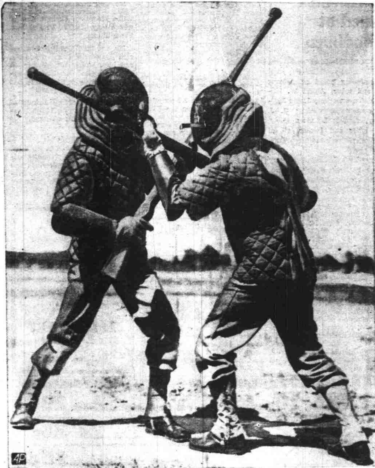
GRIM PRACTICE —Wearing protective equipment, these Camp Wolters, Tex., soldiers fence with dummy rifles bearing dummy tips. It's tough, bruising practice for a grim war job