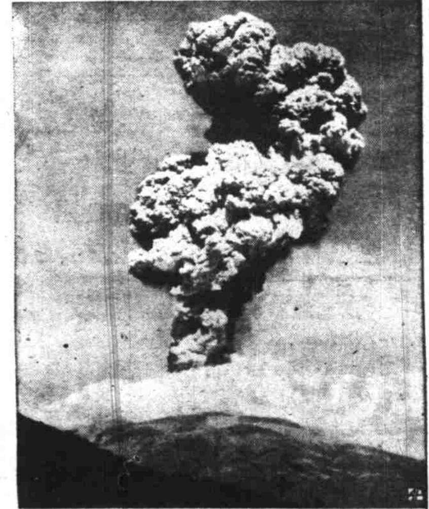
TROUBLE FOR JAPS —This is Asamayama, largest volcano in Japan, as it appeared in 1931. New eruptions were reported.