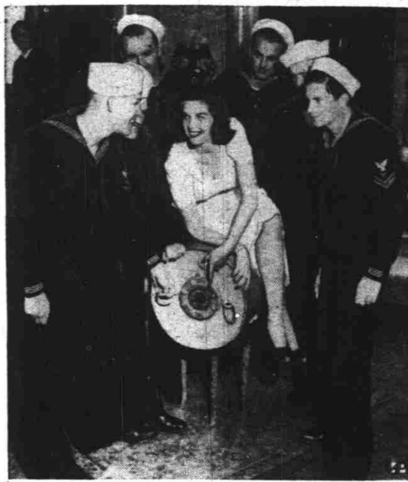
BONDS FOR 'ASHCANS' —Astride a depth charge, actress Jane Russell talks to sailors while selling bonds.