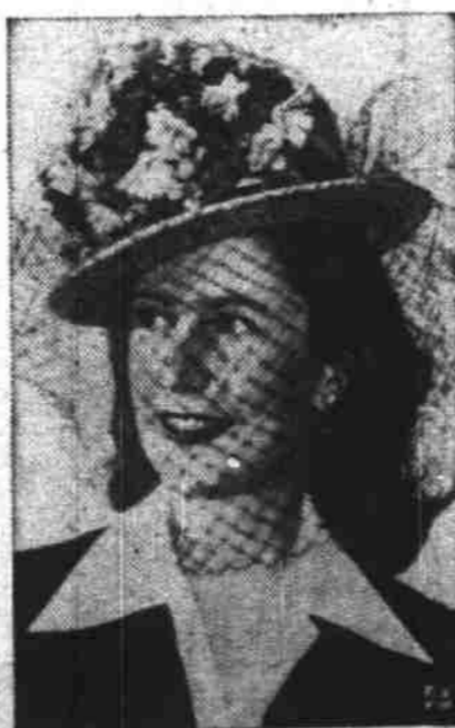
DOUBLE DUTY —Men's hats have taken their place with trousers as Film Actress Geraldine Fitzgerald demonstrates a straw hat which, when closed of flowers and a veil, is revealed as the traditional sailor straw hat for men's summer wear "Hollywood thought it up."