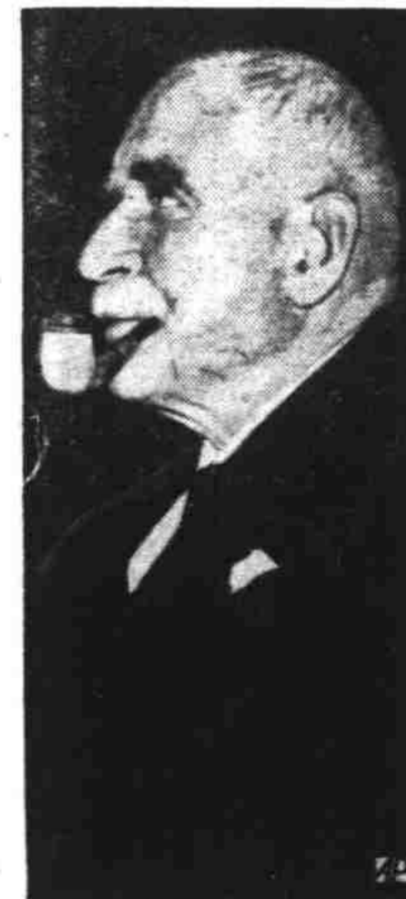
FINANCIER —This picture of J. P. Morgan, famed banker seldom photographed, was made as he watched a ceremony aboard the U.S.S. Prairie State, a training ship at New York City.