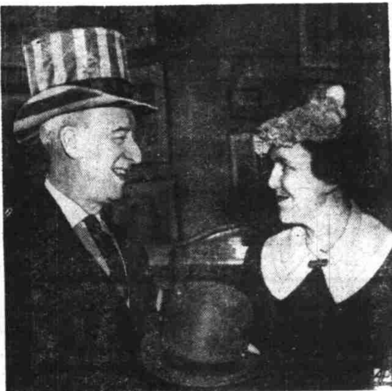
FORSAKES BROWN DERBY —Al Smith laid aside his famed brown derby as he bought a war bond show ticket.