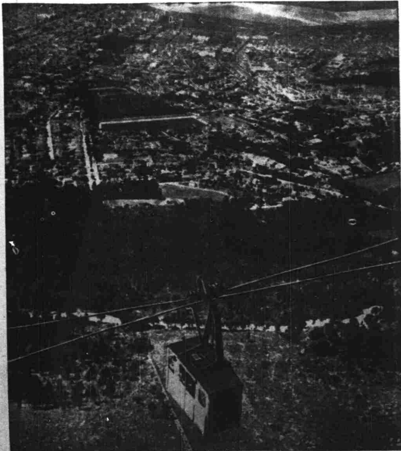
CABLE CAR VIEW OF CAPETOWN —Passengers in the cable car coming down from Table Mountain get this excellent view of Capetown, South Africa, as it sprawls out in the distance.