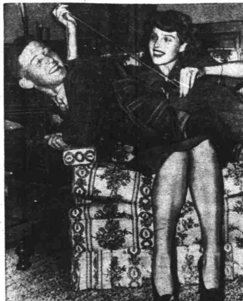
'MOTHERS' SOLDIERS —Rita Hayworth, named by Camp Callan, Calif., soldiers "their-away-from-home-mother."