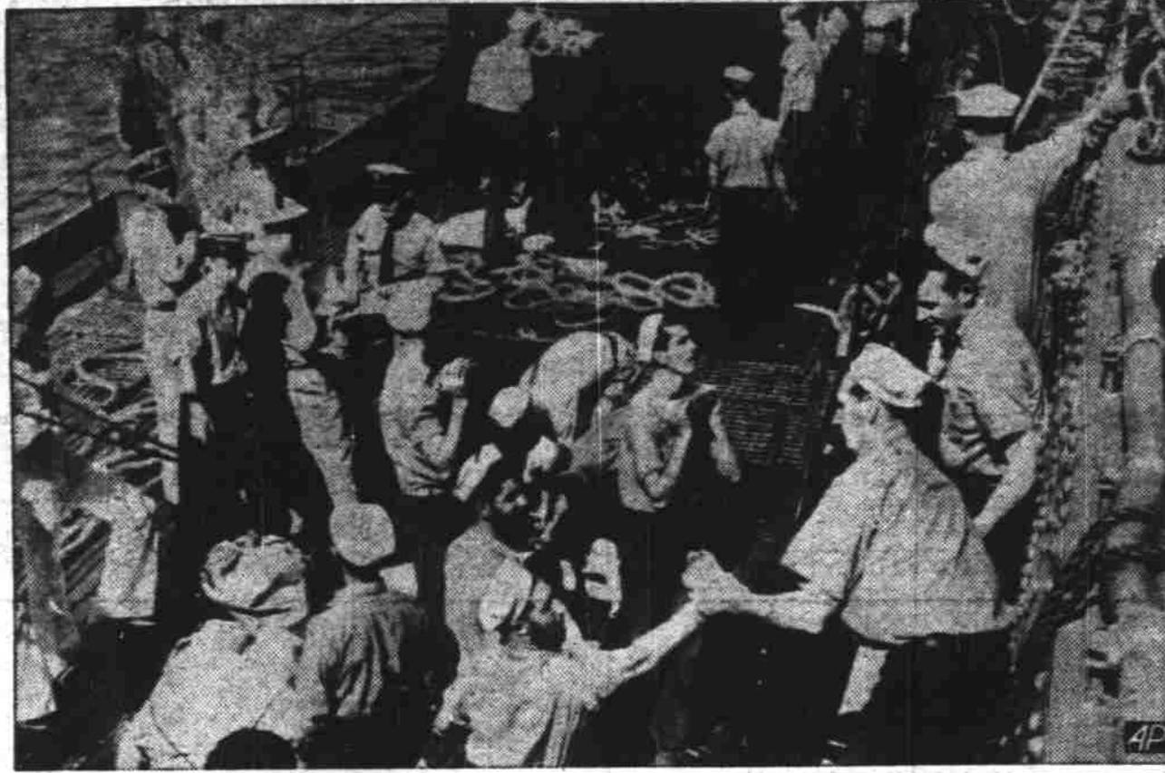
Crewmen of a US submarine which carried ammunition to embattled Corregidor right under the Japs' nose and escaped with a vast amount of gold, silver and securities are shown unloading their valuable cargo after returning safely to Pearl Harbor. The navy released this picture along with the story of the removal of the islands' wealth.