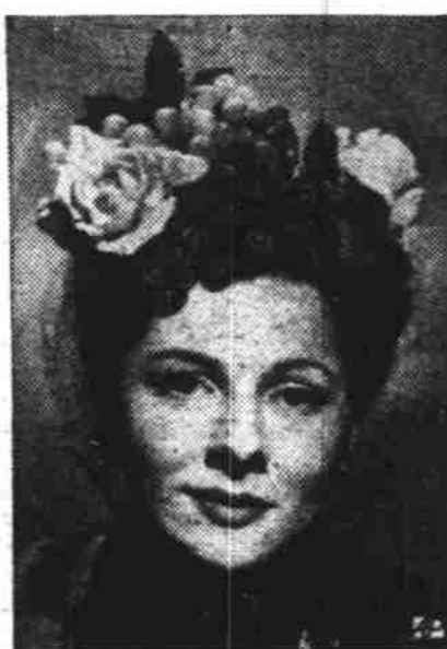
BONNET —Film Actress Joan Fontaine wears a hat accented with green and purple grapes and large pink roses.