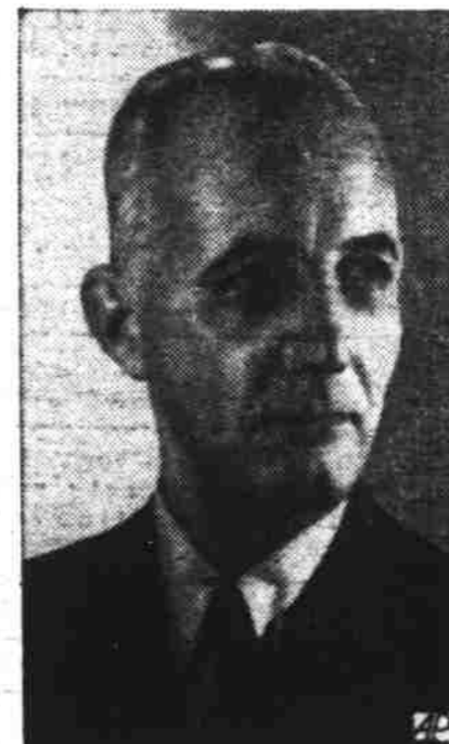
SEEKS CITIZENSHIP —Hermann Rauschning, author, and former confidant of Adolf Hitler, has applied for U.S. citizenship papers.