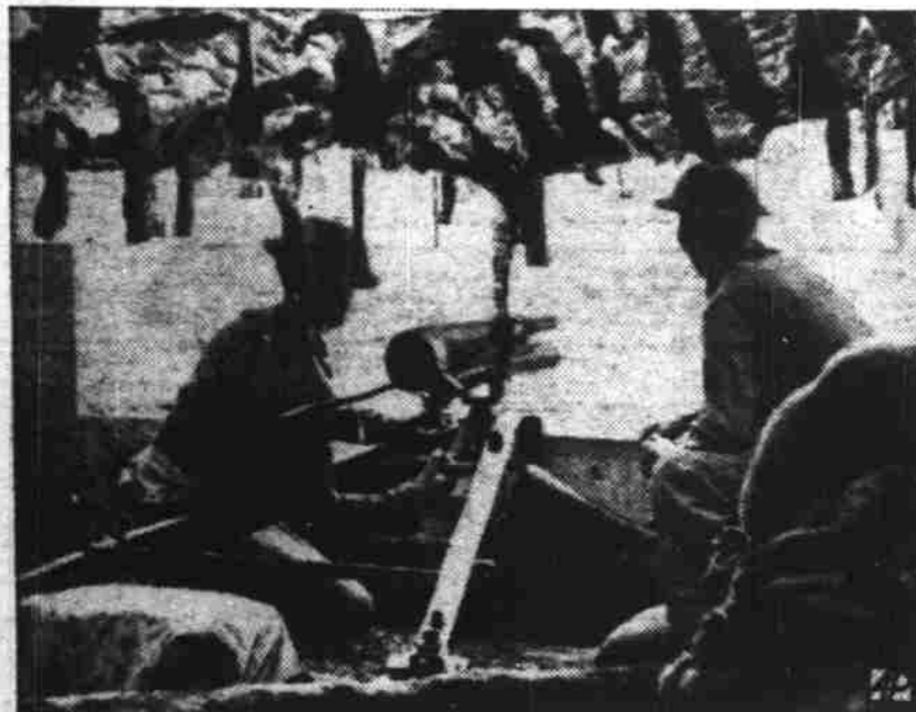
WAITING —These men in a camouflaged emplacement on an Hawaiian estate await a possible Japanese visit.