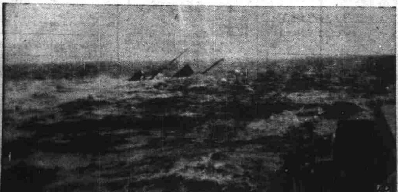
The United Nations' Atlantic ocean patrol boat from which this picture was made passes the half sunken wreck of a damaged tanker, somewhere in the Atlantic. A crewman aboard the patrol boat made the picture.