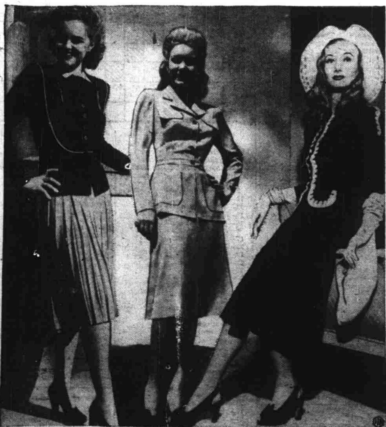
Left, two-piece dress with beige skirt, chocolate brown top; center, powder blue strutter cloth suit dress; right, black outfit with white trim

The American woman who is not in uniform is going in for good-looking clothes that are feminine without fussiness. These outfits are easy and functional yet knowingly tailored. Suit dresses are an outstanding example of this style daytime dress, and are increasingly popular with women in all walks of life. The three models shown here are all designed to do double duty. Elizabeth Frazier, left, is wearing a two-piece dress with box pleated skirt of beige crepe worn with a jacket-like top of chocolate brown with collar, buttons and binding in the beige. Jane Wyman, center, selected a suit dress of powder blue strutter cloth. The jacket is styled with high shallow lapels, flap pockets at the top and plain ones at the hips. The skirt has kick-pleats at center front and back. Veronica Lake, right, is smart in a black and white costume. The straight skirt has front fullness, and a scroll pattern of stark white cotton braid trims the front and shoulders of the waist-length fitted jacket. The hat is hand-crocheted white chenille with scroll pattern at the edge of the brim to match the suit.