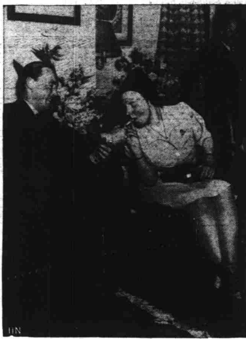
Back in the United States for a visit, Crown Princess Juliana of the Netherlands, now living in Ottawa, Canada, is shown in New York with her husband, Prince Bernhard, who recently flew from England to Ottawa. The two were holding a press conference when the picture was taken. They are planning a visit at the White House.