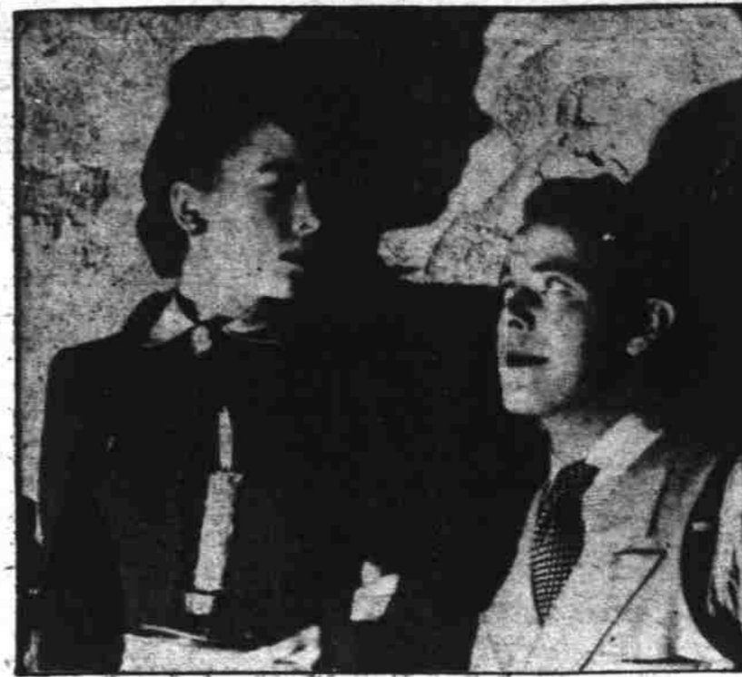
AN UNHOLY STORY of strange desires in a houseful of dreadful secrets, Ida Lupino and Louis Hayward are co-starred today at the Grand theatre in the haunting story that shocked Broadway and London "Ladies in Retirement." Co-featured is a travesty on western badmen, "Go West Young Lady," starring Penny Singleton, Charlie Ruggles and Ann Miller.