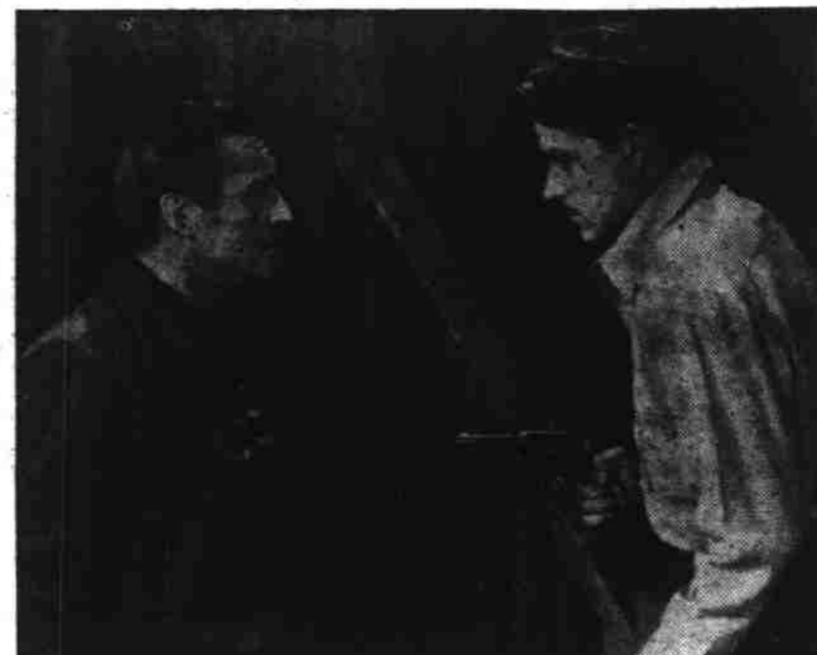
EDMUND LOWE AND BILL HENRY wage a grim "war of nerves" in the suspenseful Monogram dramatic hit, "Klondike Fury," now playing at the Capitol theatre. William K. Howard directed. Companion feature is "Sunset on the Desert," with Roy Rogers.