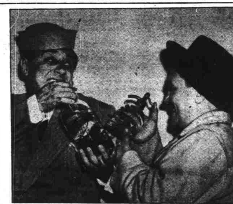
OLSEN and JOHNSON let fly at each other with seltzer bottles in a scene from "Hellzapoppin." Broadway's laugh hit showing today through Wednesday at the Hollywood theatre. Second act attraction is "Citadel of Crime" starring Robert Armstrong, Linda Hayes and Frank Albertson.