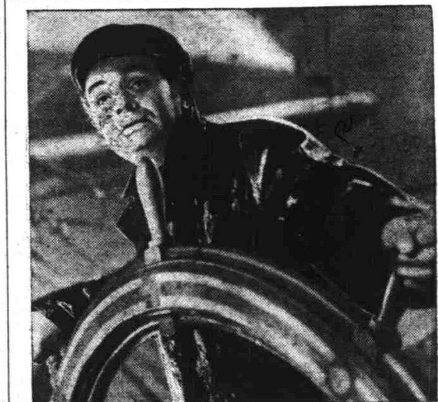
EDWARD G. ROBINSON as "The Sea Wolf" in Warner Bros. screen version of the world-famed novel by Jack London, starting today at the Liberty theatre. Cast includes Ida Lupino and John Garfield. Companion feature stars Merle Oberon, Rita Hayworth and Dennis Morgan in "Affectionately Yours."

It is only at rare intervals that the screen presents such a powerful, closely-knit drama as "Klondike Fury," the Monogram picture now playing at the Capitol theatre. The picture qualifies as engrossing entertainment, and a distinct contribution to the season's film output. When Lowe's plane crashes in the northern woods, he convalesces at a nearby trading post, where he is cared for by Miss Fairbanks, daughter of the owner. The crippled Henry, a member of the household, becomes jealous over the apparent mutual interest of the pair, but is nevertheless induced by his father to place himself in Lowe's hands for the same delicate operation in which the doctor had previously failed. The result of this situation brings the picture to an absorbing climax. Companion feature is "Sunset on the Desert" with Roy Rogers.