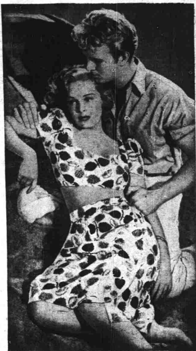
OF BOATS, beaches and beautiful blondes is the story of "Bahama Passage." Paramount's technicolor film co-starring Madeleine Carroll and Stirling Hayden, which comes today to the Elsinore theatre. Here the two blonde stars are caught in a romantic moment. Companion feature is "You're Telling Me," with Hugh Herbert.

On the set of "The Major and the Minor," I watched Ginger Rogers and Frankie Thomas dancing in a group of 15-year-old kids. Ginger is supposed to be masquerading as a youngster and, in her pink fluffy dress, she really looks as young as many of the kids. As she and Frankie danced he told her, "Boy, the way you make with your feet, it's like dancing with a puff of wind." This was in the script. Afterward, I asked 21-year-old Frankie how it felt to be a Fred Astaire with Ginger. "Now I'm living!" he exclaimed with a grin. "My grandchildren will hear about this."