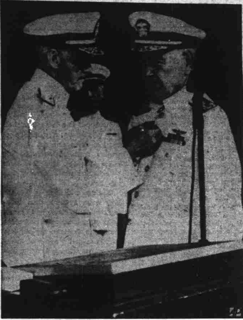
Vice-Admiral W. F. Halsey, Jr. (right) has a distinguished service medal pinned on him by Admiral Chester W. Nimitz (left) in recognition of his successful raids on Japanese bases in the Marshall and Gilbert islands. The ceremony was held aboard an aircraft carrier at Pearl Harbor.