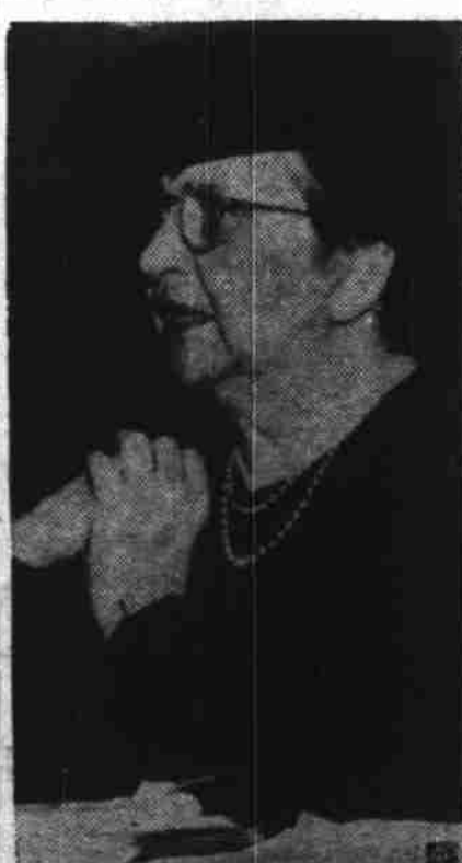
Speaking earnestly to the house naval committee in Washington, Secretary of Labor Frances Perkins (above) declared that suspension of the 40-hour work week would only reduce workers' pay envelopes and result in increased basic pay rates because "overtime is just about enough to meet the extra cost of living."