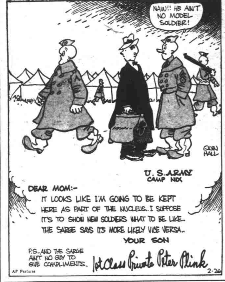
DEAR MOM— IT LOOKS LIKE I'M GOING TO BE KEPT HERE AS PART OF THE NUCLEUS. I SUPPOSE IT'S TO SHOW NEW SOLDIERS WHAT TO BE LIKE. THE SARGE SAYS IT'S MORE LIKELY VICE VERSA. YOUR SON