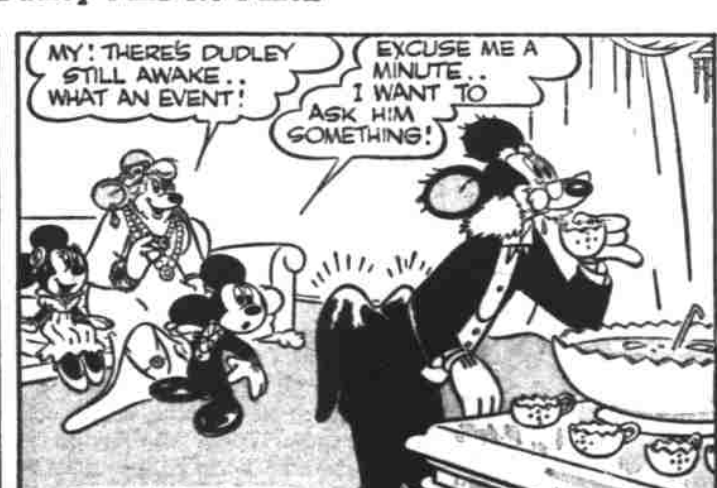
Uncle Dudley Pulls No Punch