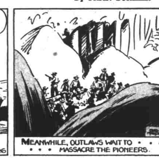
By CLIFF STERRET