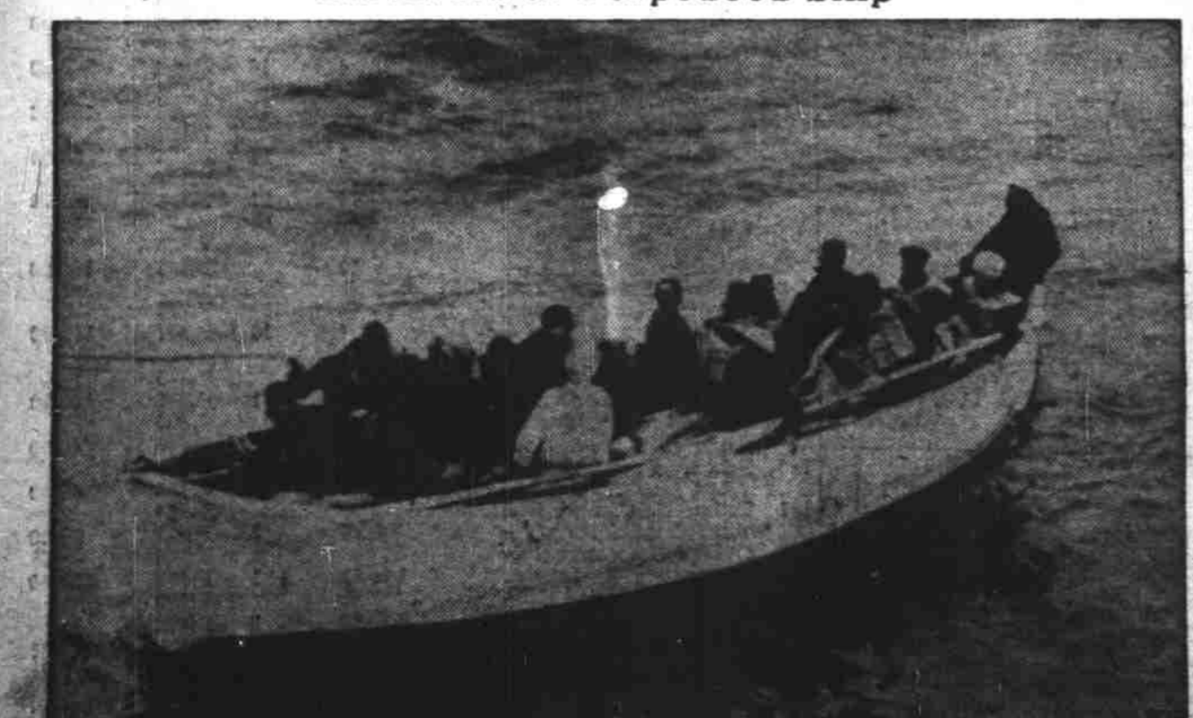
This is a boatload of survivors of the torpedoed Brazilian passenger-cargo steamer Buarque, sunk off the Virginia coast Sunday in the first axis hostilities against the South American republic since diplomatic relations were severed January 23 with Germany, Italy and Japan. So far one person is dead and one missing of the 11 passengers and 74 crewmen aboard. These survivors are nearing their rescue ship.