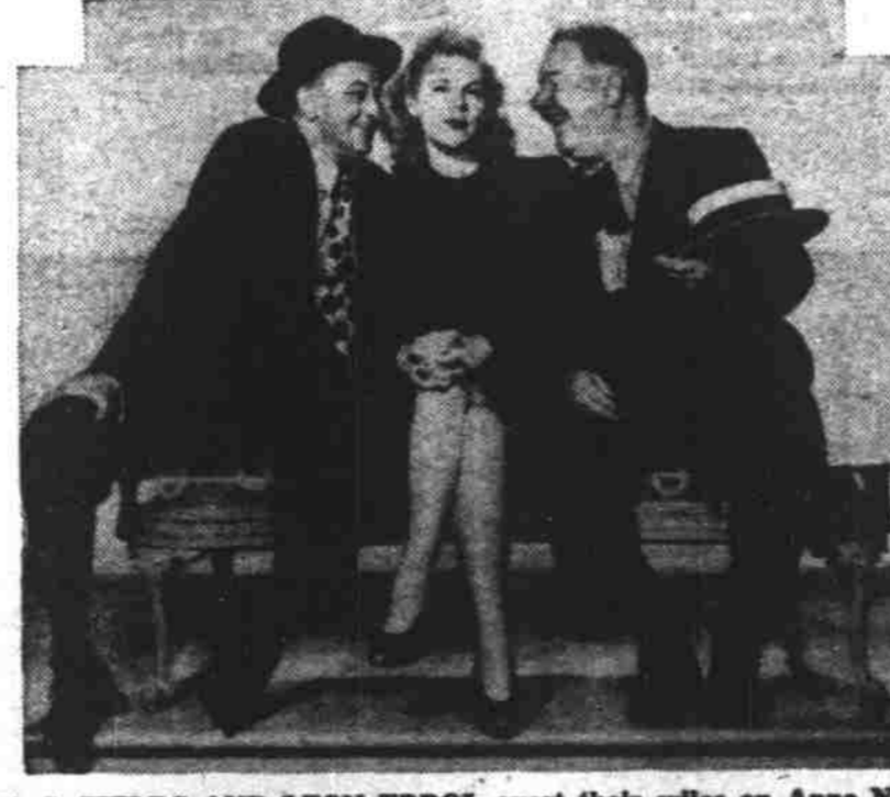
W. C. FIELDS AND LEON ERROL, exert their wiles on Anne Nagle to no avail in "Never Give a Sucker an Even Break," which starts today at the Hollywood theatre. Second feature is "Moonlight in Hawaii," with Mischa Auer, the Merry Maes, Johnny Downs, and Jane Frazee.