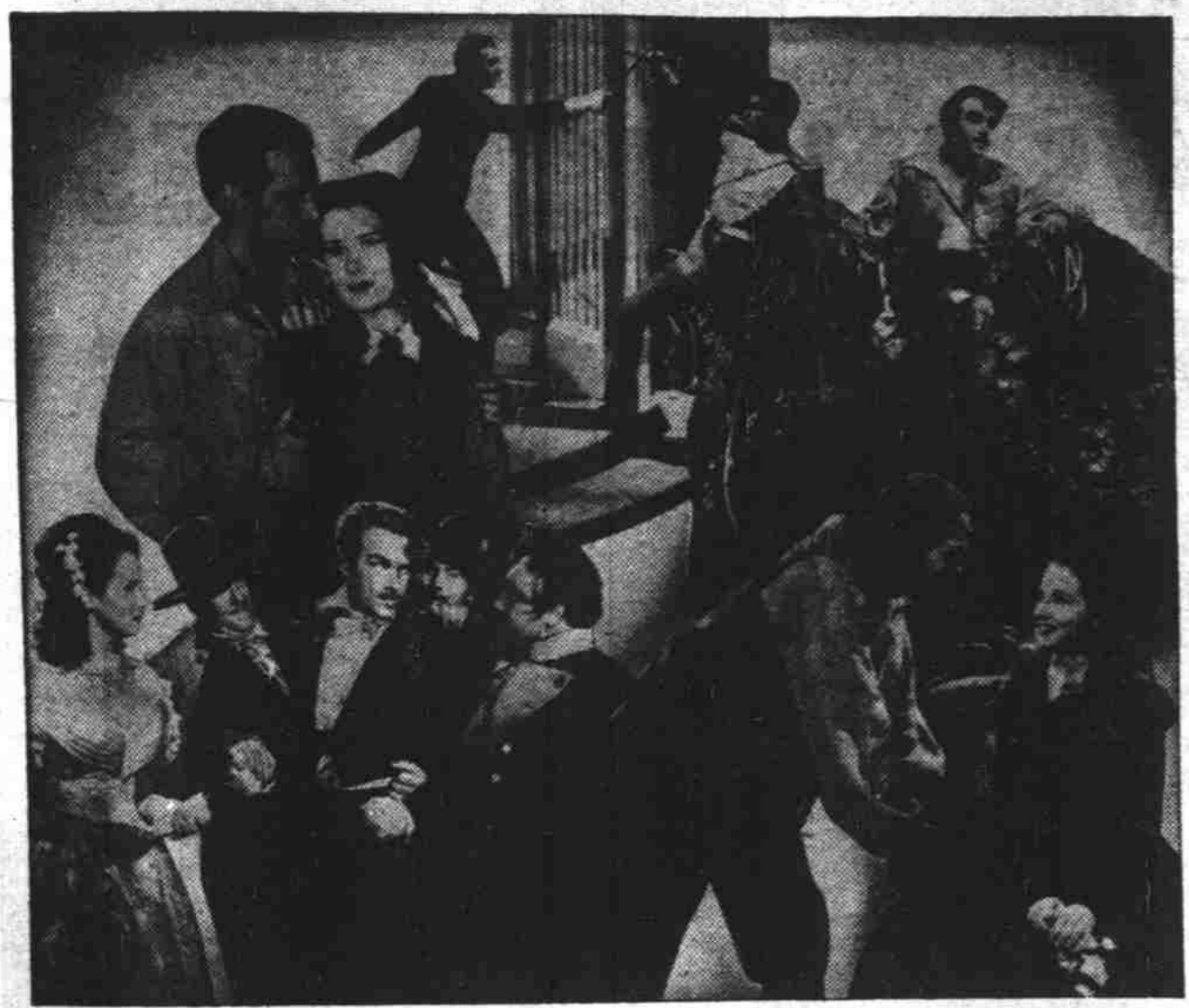
EDWARD SMALL'S LAVISH film production of the great Alexander Dumas classic, "The Corsican Brothers," now showing at the Elsinore theatre, fills the screen with stirring romance, action drama and thrill-packed adventure.