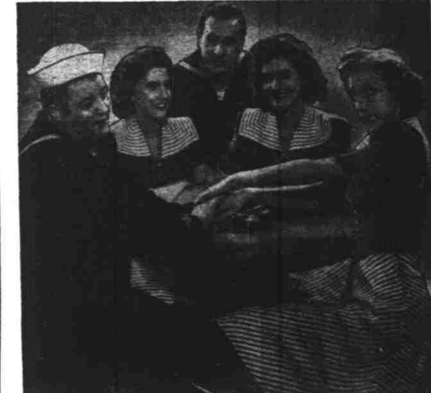
LOU COSTELLO with Bud Abbott and the Andrews sisters in Universal's gay comedy, "In the Navy" starts today at the Liberty. Companion feature is "Model Wife" starring Joan Blondell and Dick Powell.