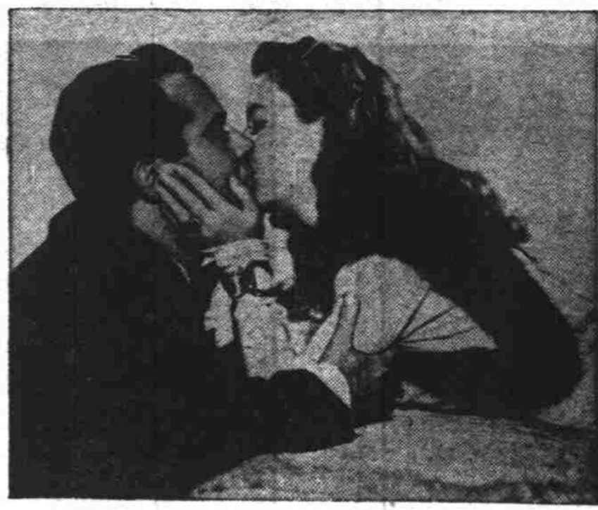
THAT LOVABLE, LAUGHABLE "Lady Eve" couple in a merry martial marathon in "You Belong to Me" now showing at the State theatre, and starring Barbara Stanwyck and Henry Fonda. Co-featured is "Two Latins From Manhattan" with Joan Davis and Jinx Falkenberg.

Sec. 2—Page 5 Sunday Morning, February 15, 1942