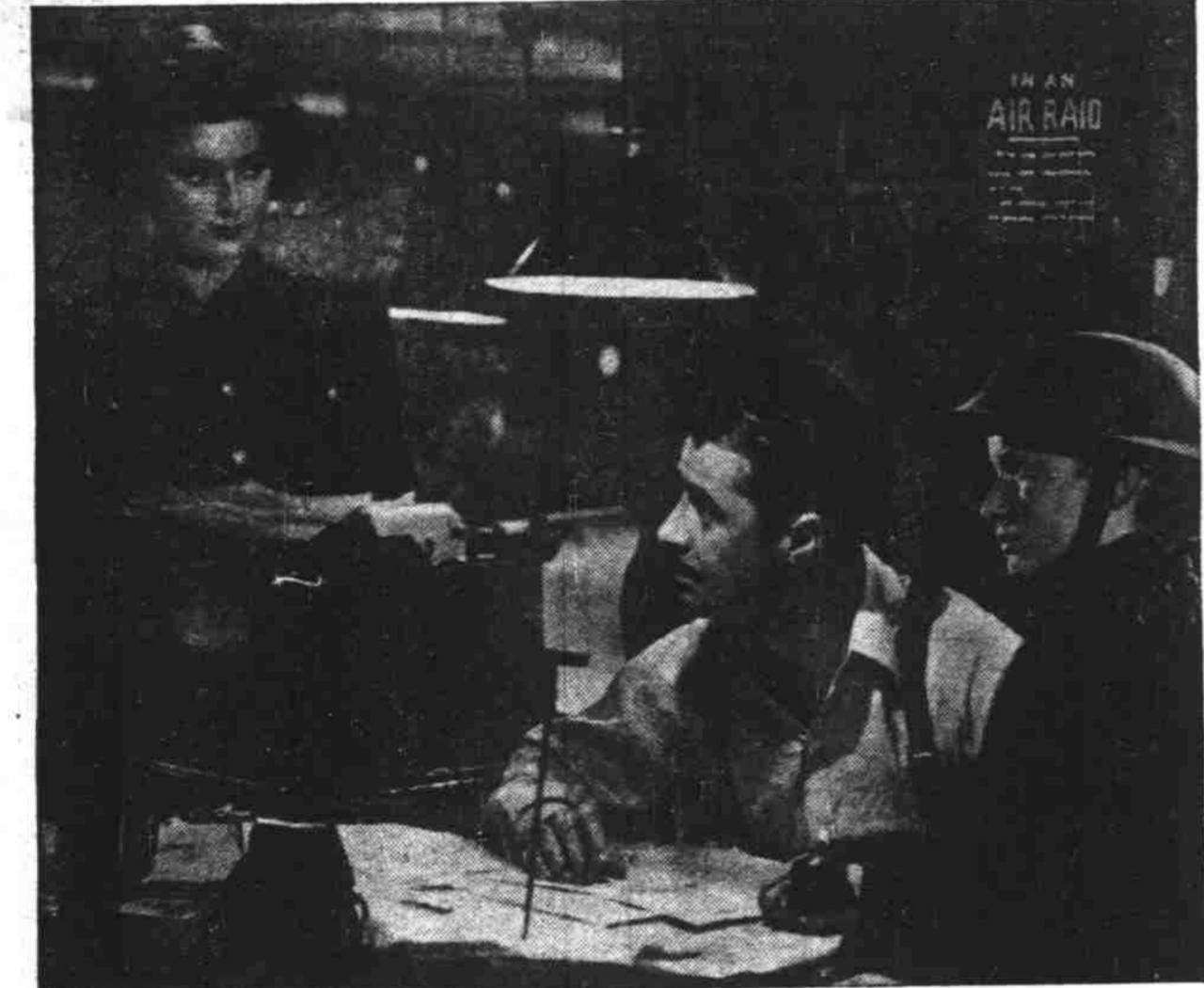
"I DON'T MAKE NEWS... I WRITE IT." Don Ameche, an ace correspondent who goes through London's greatest bombardments to report to millions of newspaper readers the hottest news in Europe in "Confirm or Deny," now showing at the Grand theatre. Co-starred are Joan Bennett, a fighting English girl who finds love in London's bomb-washed streets, and Roddy McDowall, the star of "How Green Was My Valley." Co-featured is "A Gentleman at Heart" with Cesar Romero.