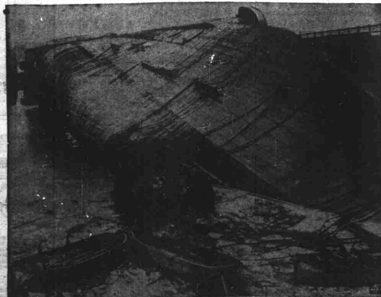
The designer of the capsized Normandie said that the fallen giant could be righted only by its own buoyancy and estimated that that job would take five months. "Men and machines aren't powerful enough," Vladimir L. Youpevitch said. "The Normandie will have to save itself." As the first step in salvaging the fire-scarred $60,000,000 liner that was the pride of France, he said all openings and vents in the ship's upper part, now under water, must be repaired and the compartments pumped free of water. Then he would pour 6000 tons of water into the double bottom and fill other lower compartments to help create buoyancy.