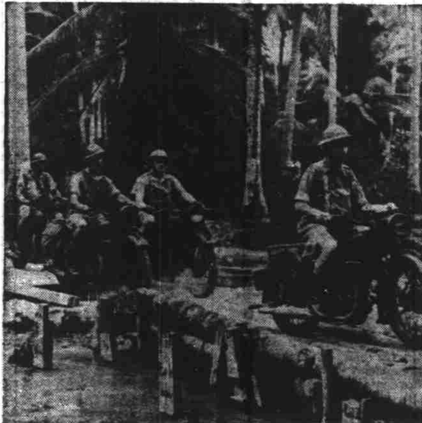
This photograph, airmailed to The Statesman, shows British dispatch riders carrying orders from inland Singapore island to army headquarters in the doomed British bastion.