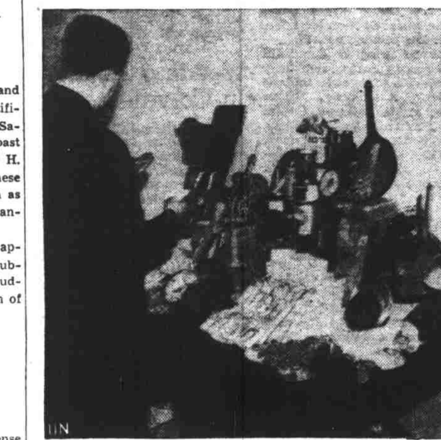
Federal agents have cracked down on a counterfeiting ring in New York, raiding two places, one of which was described as "the biggest counterfeiting plant seized in years." Three men were seized and held as suspects. Photo above shows some of the phony money and equipment seized.