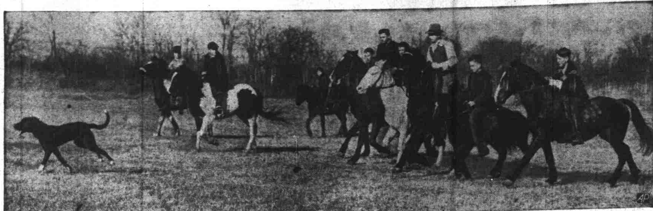
YOUNG CHIPS OFF OLD PAUL REVERE —To help Uncle Sam by carrying messages in a 150-mile-square area when air raids jam telephone wires, these Boy Scouts of Segreganset, a part of Dighton, Mass., have banded together for patrol work and are ready, like Paul Revere, "to ride and spread the alarm."