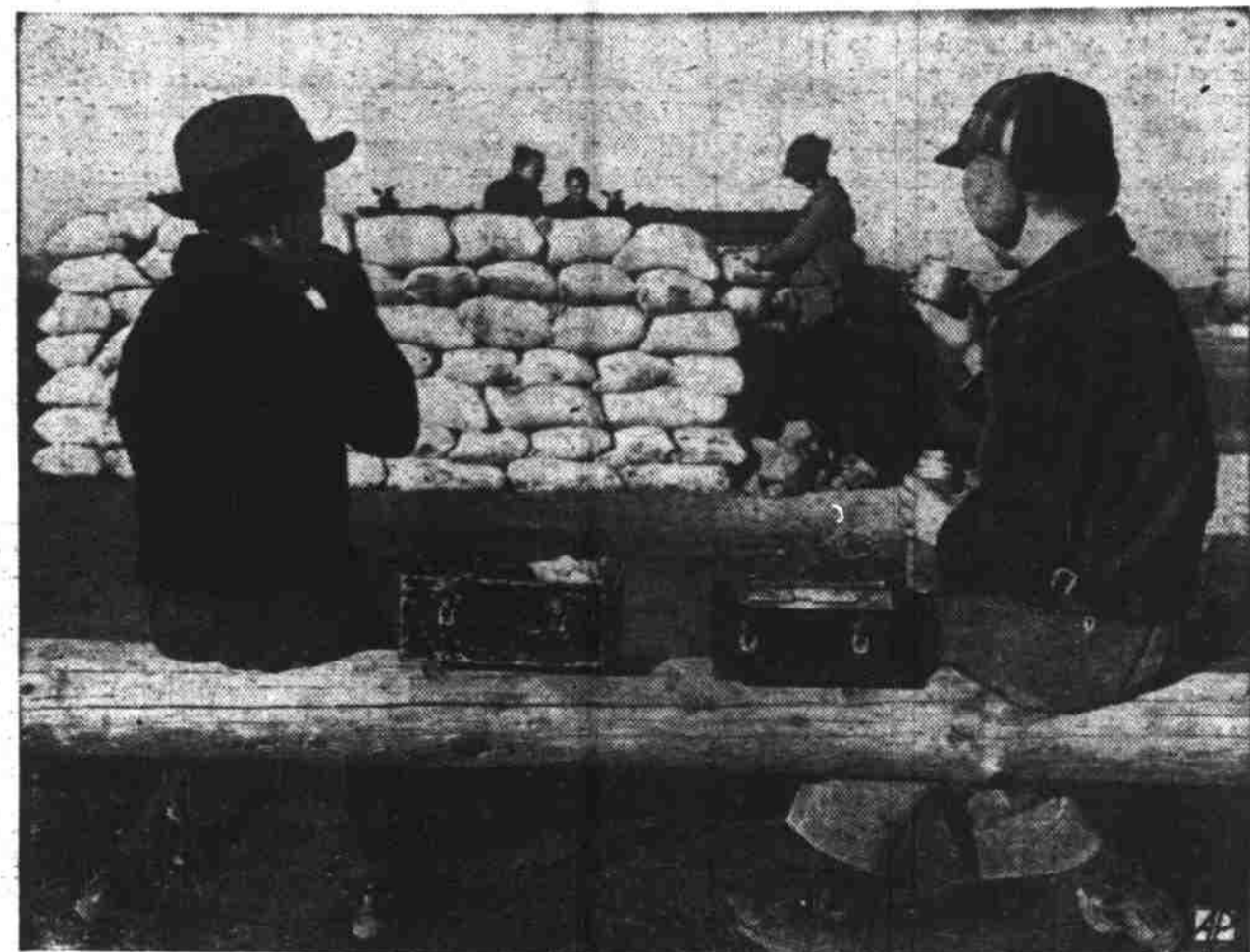
LESSON IN DEFENSE —Usual games are forgotten in this Pacific Northwest spot where an anti-aircraft range-finder has moved into the schoolyard, to great delight of these boys.