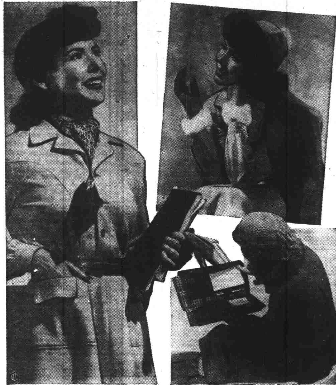
Left, campus outfit consisting of shirtwaist dress with paisley scarf and crocheted beanie; top right, red suede beanie and mittens trimmed with white fur; below, flipper bag.

With the holidays only a faint memory, the college girl has settled down for the long winter term of hard work, cold weather, and few changes. To keep from getting the doldrums she should indulge in the purchase of a few colorful accessories that she can wear around the campus and to the movies. Top left is a classic campus outfit consisting of shirtwaist dress and crocheted beanie. The Waverly scarf worn with the frock is in paisley pattern in soft, muted tones. The solid color border being drawn through the button opening in casual fashion. The set, top right, consists of bright red suede mittens created by Bacmo, and matching beanie, both trimmed with soft white fur. Below is a flipper bag which contains mirror, comb, keycase, pencil, nail file and identification card, each in its own compartment. The other side has a change purse and room for lipstick, compact, pad and pencil, and the whole thing is no larger than an ordinary handbag. It was created for the college set, and Frilo was the designer.