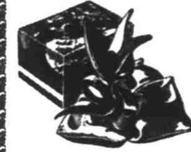
cal with a "Bean Bag Sachet." Satiny luscious, its Mon Image (My Image) fragrance is the