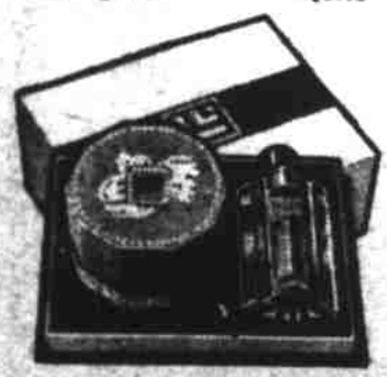
"Whisper" Presentation Contains "Whisper" Perfumer