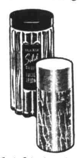
· Lucien Lelong's amazing new "Balalaika" Solid Cologne is a new creation. Rubs on, stays fragrant for bours.