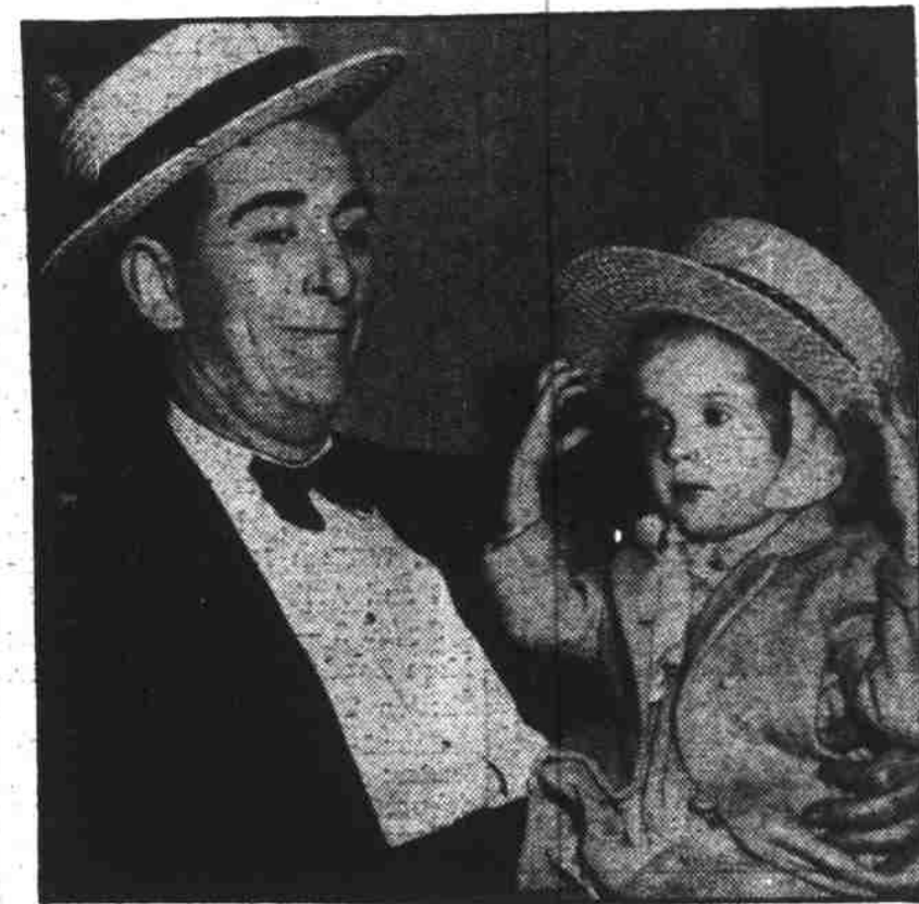
WHICH HAT FITS?—that on Edward Everett Horton or on Baby Sandy. They are shown in a scene from the gay comedy, "Bachelor Daddy," now at the Hollywood theatre. Second feature is Clark Gable and Rosalind Russell in "They Met in Bombay."

10 Salem, Oregon, Sunday Morning, December 21, 1941