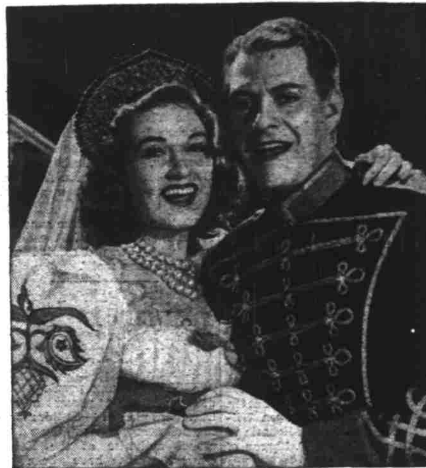
NEW TO THE SCREEN is Rise Stevens, who is co-starred with Nelson Eddy in "The Chocolate Soldier," which is playing today at the Elsinore theatre. "The Gay Falcon" with George Sanders and Wendy Barrie is the companion feature.