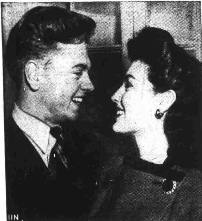
WEDDING OF MICKEY ROONEY, 20, the star of the "Andy Hardy" films, and Ava Gardner, 18-year-old actress, is expected soon. Rooney, confirming the report, told newsmen that "I fell in love with her as soon as I set eyes upon her, and ever since I've been working up courage to propose to her."