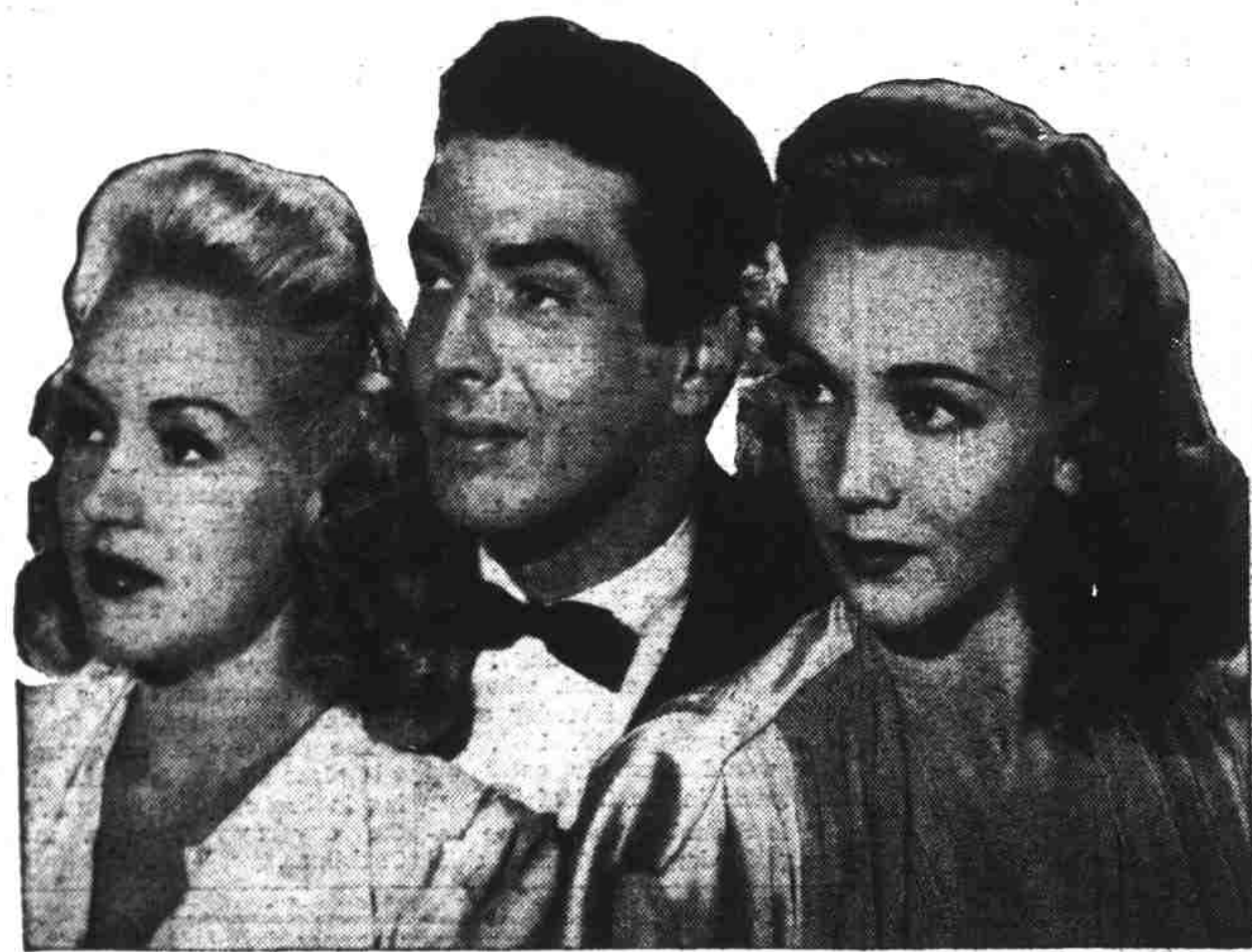
THREE GOOD REASONS why the new hit, "I Wake up Screaming," is popular at the Grand theatre. Betty Grable, Victor Mature and Carole Landis. Carole and Betty are teamed as sisters again—they were sisters in "Moon Over Miami." Vic is the guy who has to make up his mind as to whom is the more desirable. Laird Cregar, William Gargan, Alan Mowbray and Allyn Joslyn complete the featured cast.