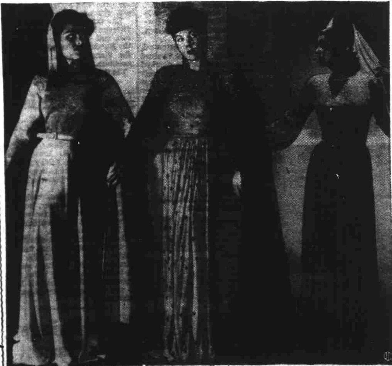
Left to right, pink crepe gown with matching hood; petunia silk jersey embroidered in jet, purple wool cape; blue crepe with silver and bead embroidered yoke, turban-like hat.

Glamorous high shades, lavish metallic and bead embroidery are being used for after-dark creations which are frequently fashioned with Oriental exoticism. Fitted silhouettes flare into swirling skirts and are offset by glistening embroidery. First of the gowns shown here, left, has a unique coat-of-mail effect, achieved by hand-crocheting. The dress is a Montell pink crepe and has a matching hood edged with long silken fringe. Long, fitted sleeves, a belt of the same material and full skirt are fashioned with long silken fringe. The dress center is made of petunia silk jersey embroidered in jet, with high draped neckline, clinging waistline and front drape. The long purple wool cape is lined with contrasting lavender, clinging to the shoulders over the shoulders with multi-colored stones. The Oriental influence is clearly seen in the third dress, right. It is a Cooper blue crepe with a silver and bead embroidered yoke, smooth kimono sleeves blousing above gauntlet-length gloves, and two slit pockets at the side seams of the dirndl skirt. The turban-like hat is of the same blue as the dress, and also is bead embroidered, with a soft veil flowing down the back and velvet band that goes under the chin and up over the high crown of the hat.