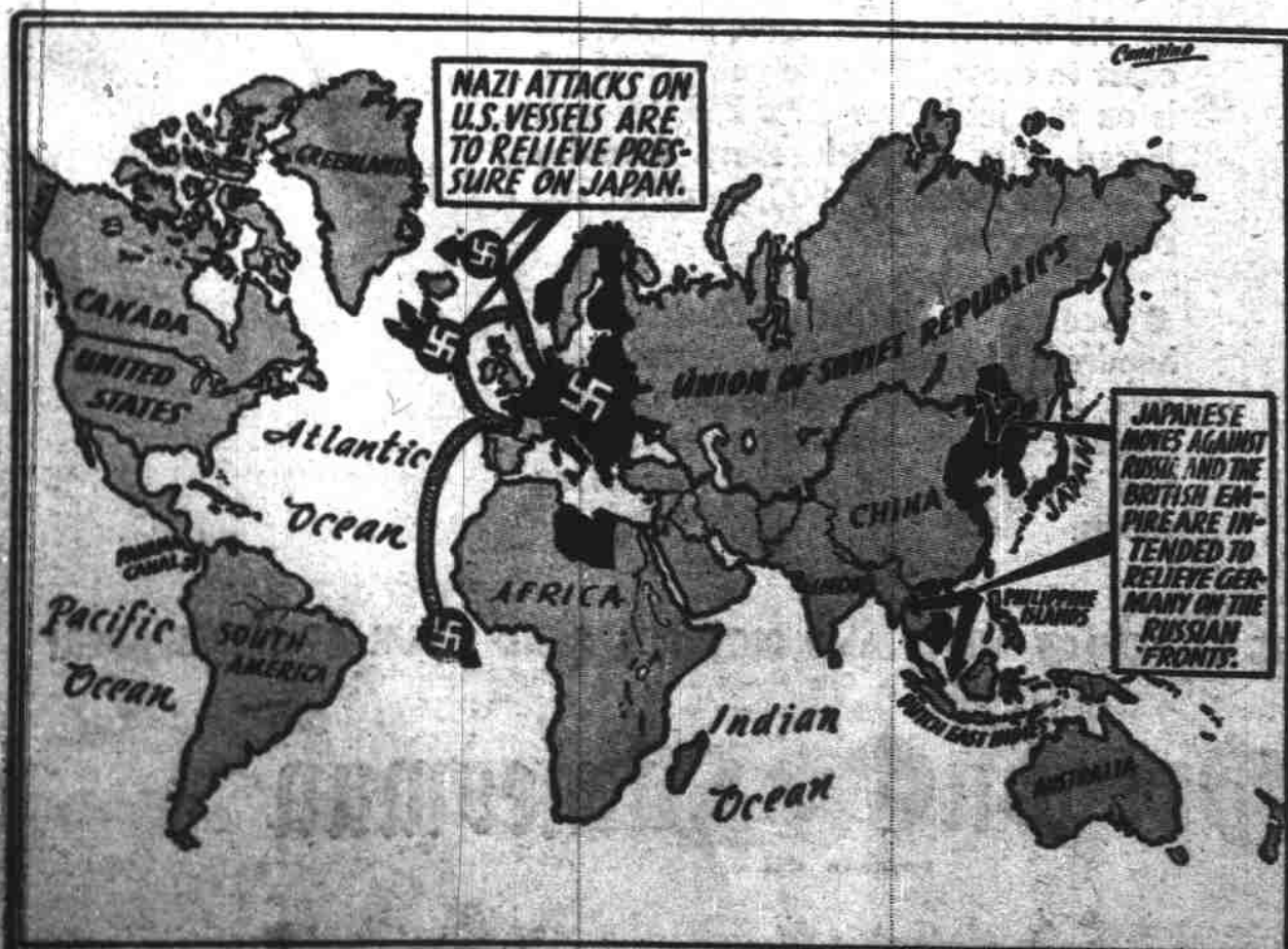
Trouble in the Pacific is considered a distinct possibility as a result of the sinking of the Rubeen James. Frequent German attacks on U. S. war and merchant ships in the Atlantic is seen as undoubted encouragement to Japan to join the Axis war in Asia, thus preventing further transfer of Eastern Siberian troops to European Russia, and diverting General Wavell's attention from the Caucasus to Eastern India.