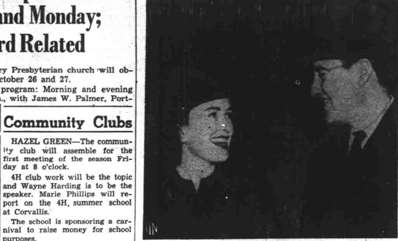
W. Averell Harriman, head of the American delegation of the British-American mission to Moscow, is greeted by his daughter on his return to London. The mission went to Moscow to plan for all possible war aid to the Soviets.