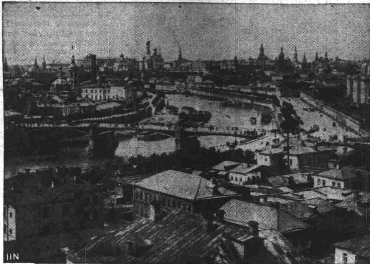
Moscow, the Soviet capital, is in peril as the German armies advance closer and closer. An excellent view of Moscow is shown. Situated on the Moskva river, Moscow has a population of 4,137,000 by the latest census. It is a city of lofty modern structures, and many churches. Here is the Kremlin, the holy place of the Russians, which rises like a citadel in the middle of the city on the left bank of the Moskva. The Kremlin, with its lofty encompassing walls and towers, encloses the former palace of the czar among other famous buildings.