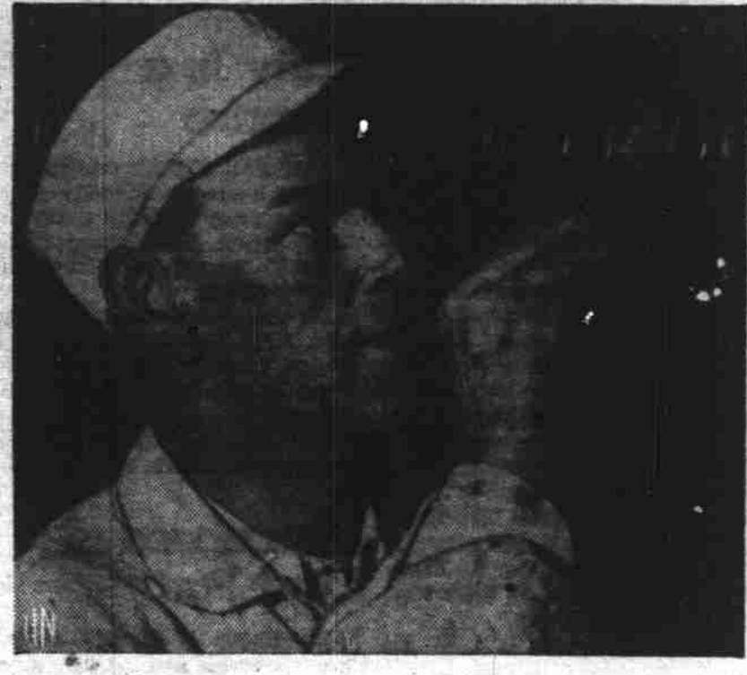
This Winston Churchill is a paper-hanger and painter in Natick, Mass. Unlike the other Churchill, who is prime minister of England, he has no political ambitions and does not smoke eigars.