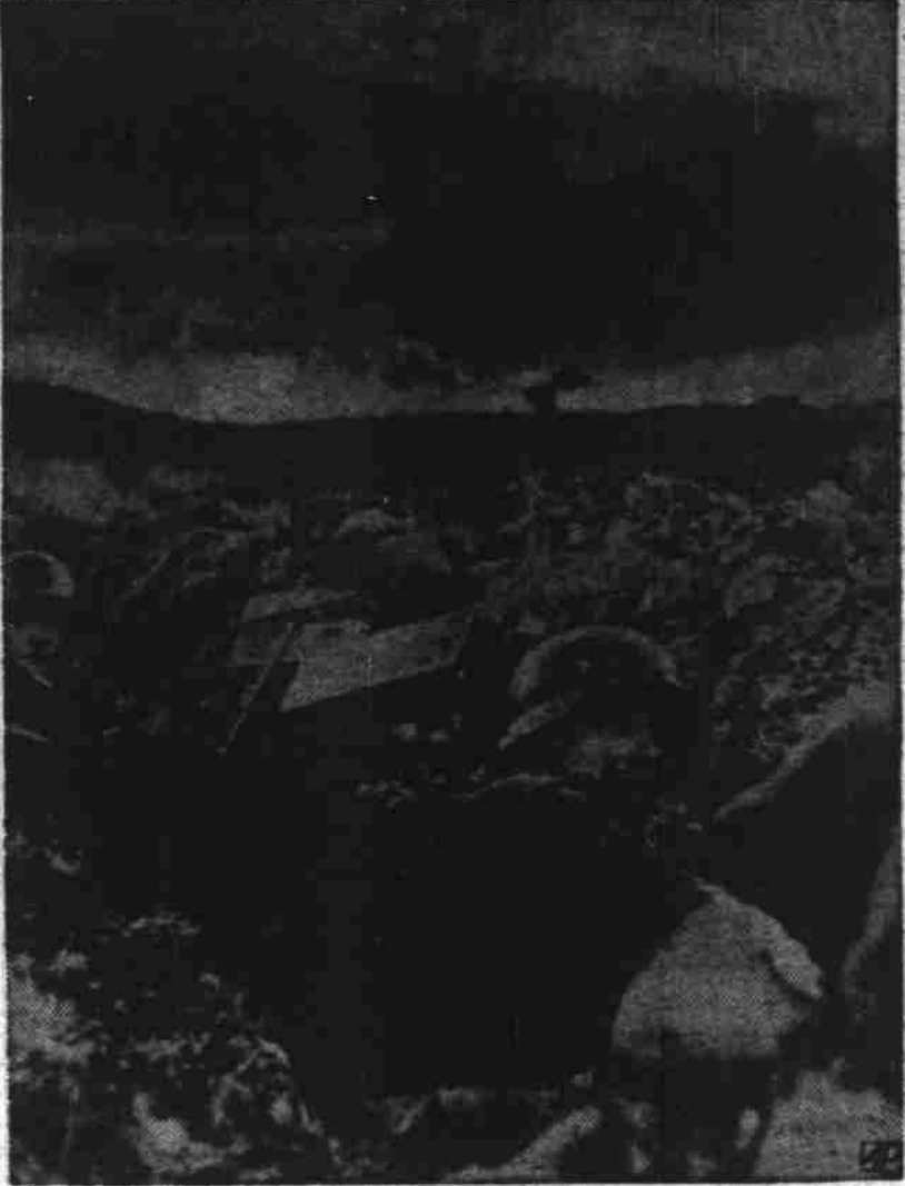
German soldiers wait in trenches along the central sector of the eastern front, according to Berlin sources, as German artillery barrages attempt to prepare the way for infantry movement. The German high command declared that the last fully effective Russian armies remaining on the whole eastern front were fatally encircled in two areas along the center before Moscow. This picture was transmitted by radio from Berlin to the United States.