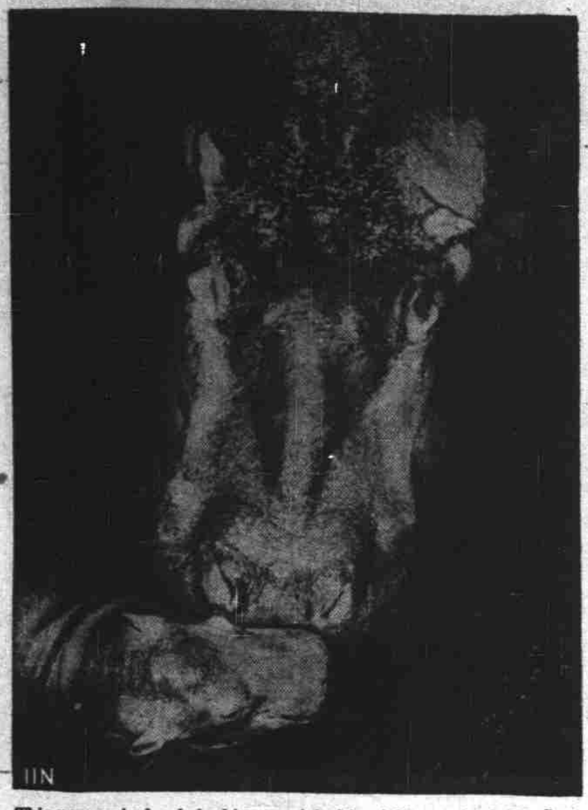
This new arrival, a baby hippo, weighed in at 35 pounds at Chicago's Brookfield zoo. The baby takes her first bath with mama looking on.