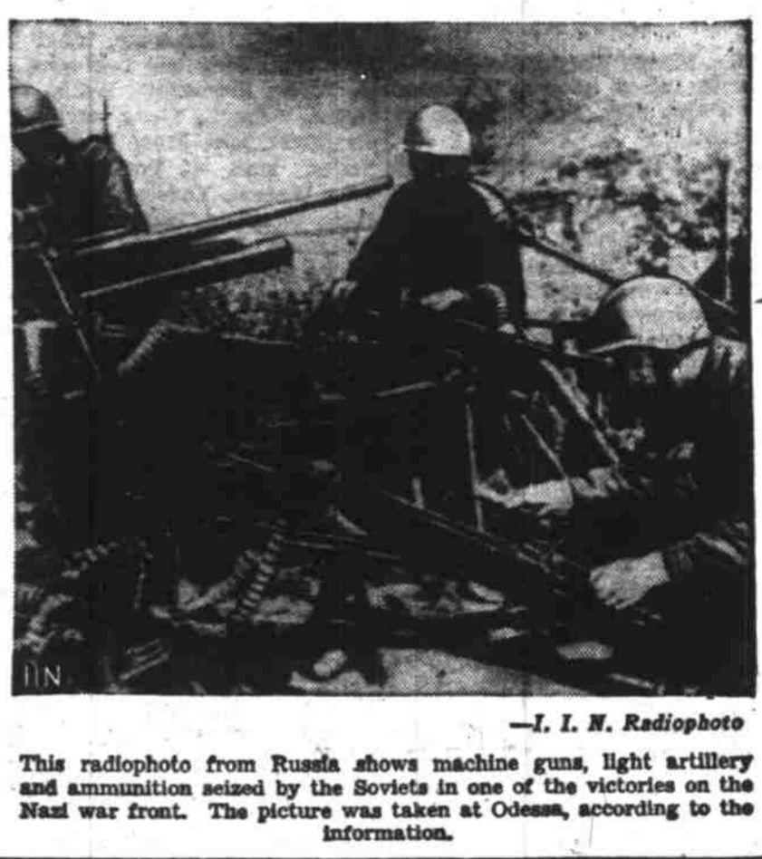
Reds Took These From The Nazis

This radiophoto from Russia shows machine guns, light artillery and ammunition seized by the Soviets in one of the victories on the Nazi war front. The picture was taken at Odessa, according to the information.