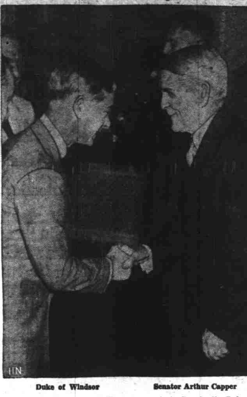
Before departing from Washington en route to Canada, the Duke of Windsor was feted at a National Press club dinner and there met among others Senator Arthur Capper of Kansas, member of the senate foreign relations committee. The Windsors plan to go to his ranch in Alberta, Canada.