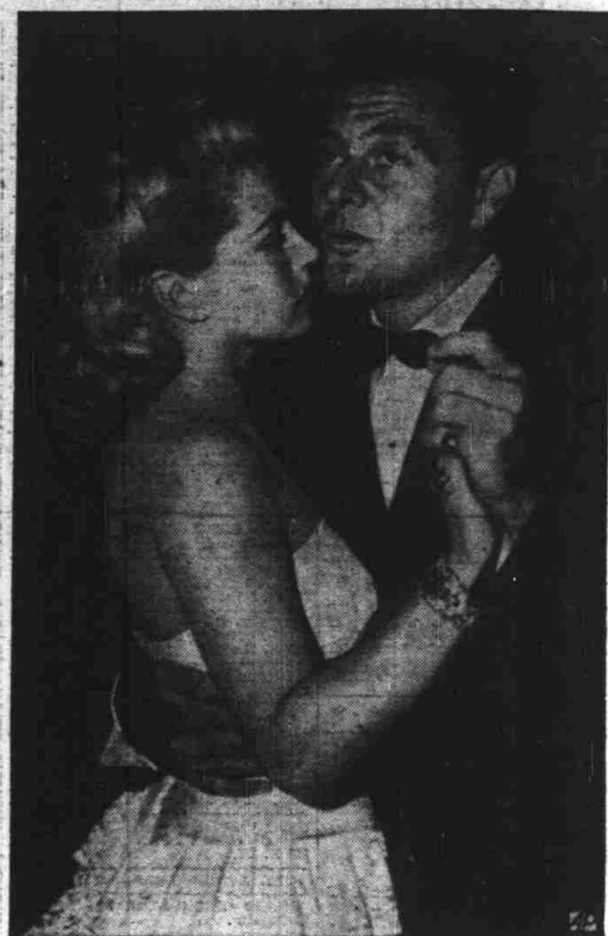
BLONDE AND BEAU —A strapless white lace frock set off the curvesome charms of Film Actress Lana Turner for her dance-date with Tony Martin. Her jewels (take another look, now!) are a bracelet and ring set of diamonds, star sapphires.