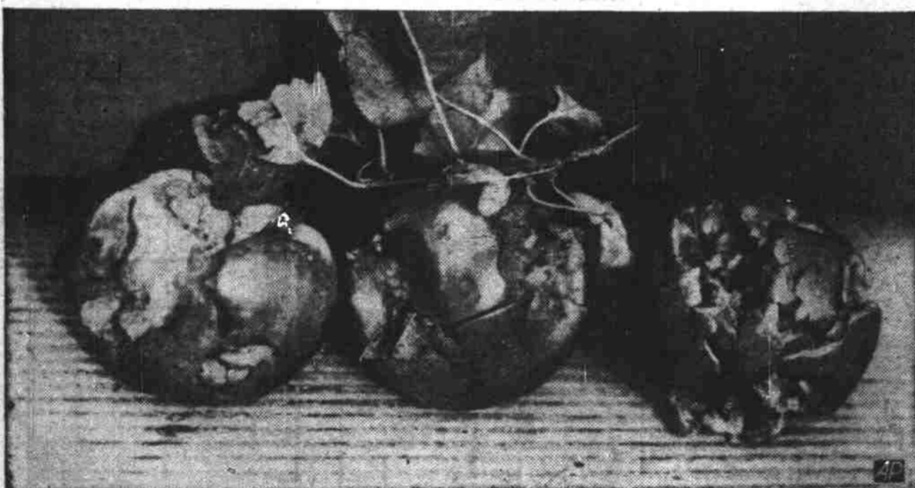
HAIL 'PUTS THE BITE ON' —Recent fall of huge hailstones in New York state's Ontario region ruined several orchards and left cavernous pits in the apples, as seen above.