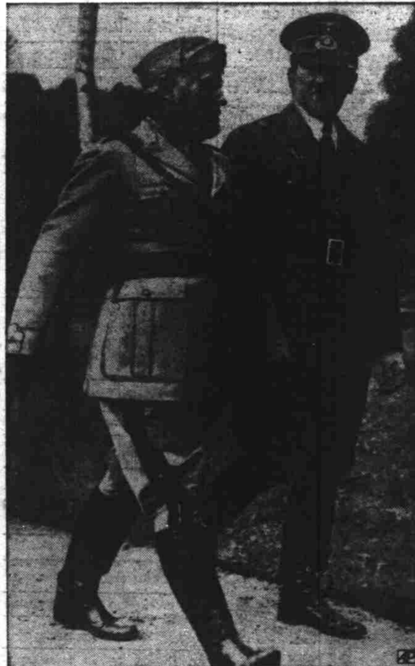
AXIS PARTNERS —Fall of 1941 finds these two, Mussolini (left) and Hitler, still busy remaking maps, the friendship that bloomed about middle 1939 still flowering. Middle-aged and paunchy, they recently conferred at the eastern front.