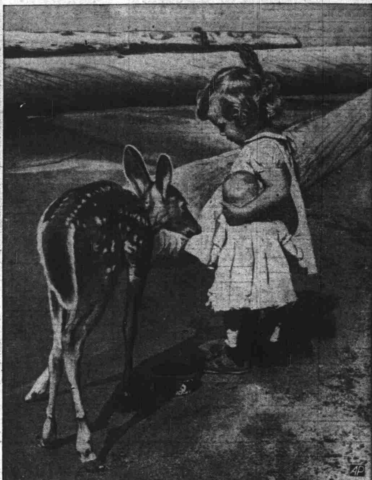
DEER MEETS DEAR —Little Susie Hughes is OK, but that doll troubles a young deer rescued from bears by Susie's father, Len Hughes, a guide at Camp Champlain in North Bay, Ontario.