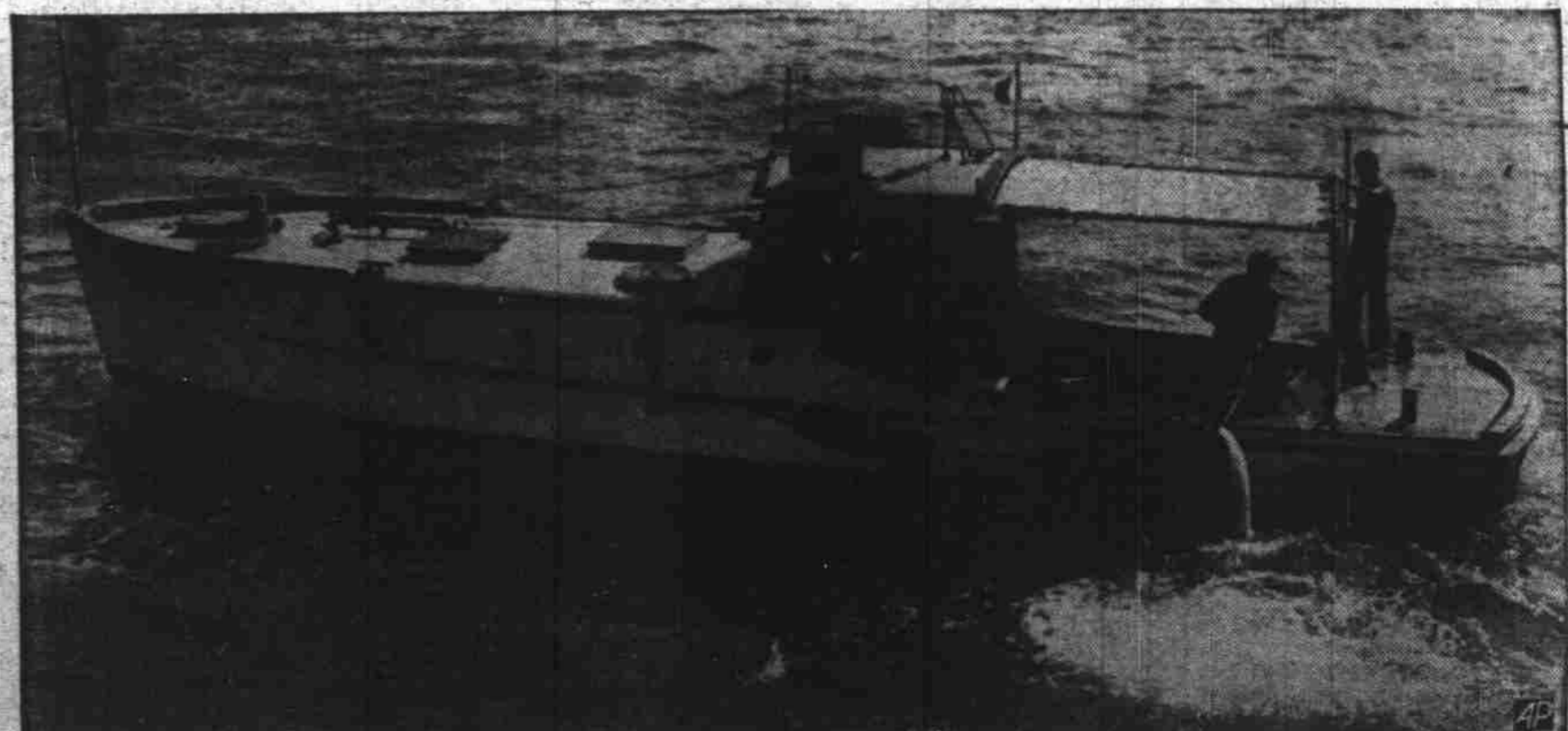
SAILOR GAFFS A TORPEDO IN NAVAL FIRING TESTS —A practice torpedo, loaded with air so it'll not sink after the propelling mechanism runs down, is lifted aboard a navy "retriever boat" during torpedo-firing tests off Piney Point, Md.