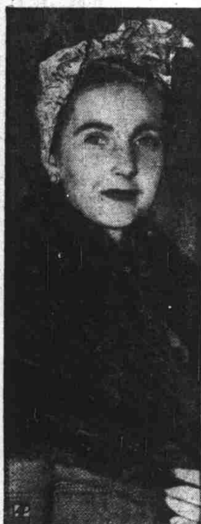
HEIRESS —A colored bandanna handkerchief wrapped about hair that seems a few shades darker, Barbara Hutton of dime-store fortune arrived in Los Angeles after flight from Mexico City. She also wore a tweed suit, long mink stole.