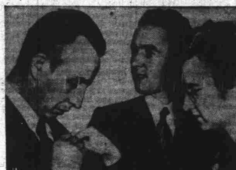
A "V" for victory is planned on the lapel of Brig. Gen. Mikhail Gromov, leader of the Soviet flying mission, in Seattle, Wash. The 47 men, who came with Gen. Gromov in two huge seaplanes from Moscow, will study airplane production in the U. S., according to the war department.