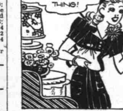
By FRAN STRIKER