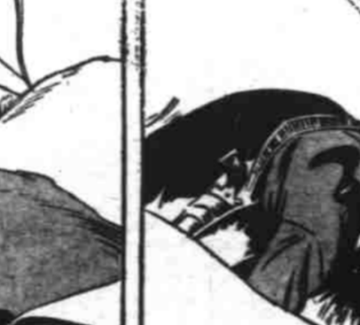
By FRAN STRIKER