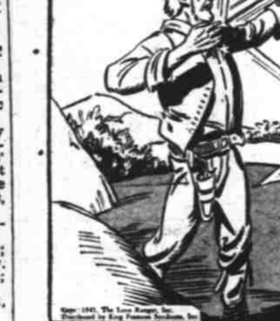
By CHIC YOUNG