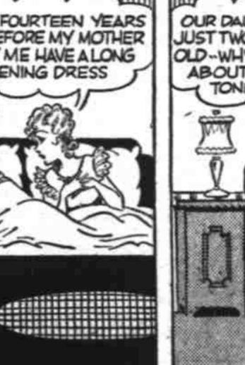
By CHIC YOUNG