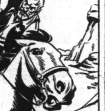
By FRAN STRIKER