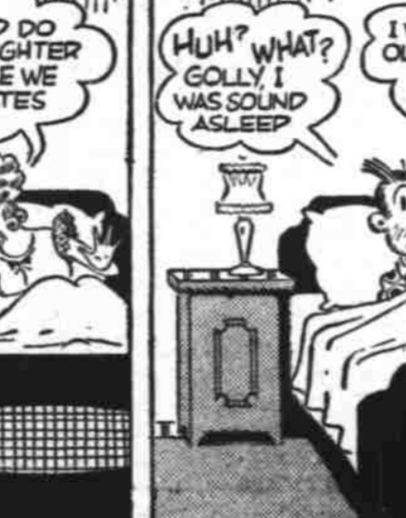
By CHIC YOUNG