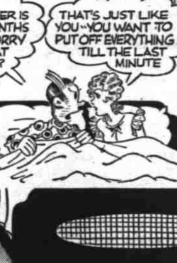
By CHIC YOUNG