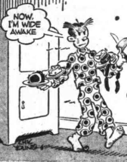
By CHIC YOUNG