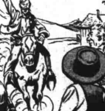
By FRAN STRIKER