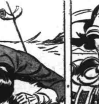
By FRAN STRIKER