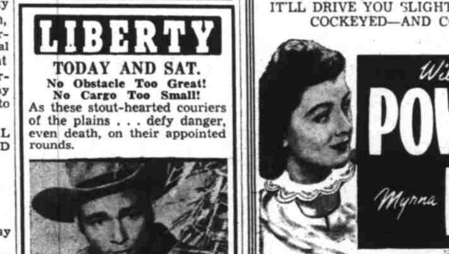
ROY ROGERS MARY HART

TODAY AND SAT. No Obstacle Too Great! No Cargo Too Small! As these stout-hearted couriers of the plains... defy danger, even death, on their appointed rounds.