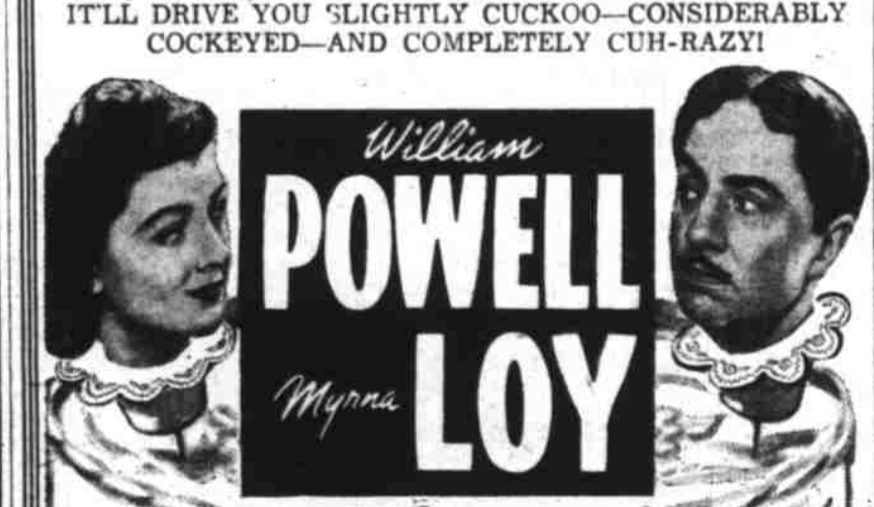
William POWELL LOY Myrna

WARNER'S ELSONORE SALEM'S LEADING THEATRE 3798 STARTS TODAY - TWO TOP FEATURES IT'LL DRIVE YOU SLIGHTLY CUCKOO—CONSIDERABLY COCKEYED—AND COMPLETELY CUH-RAZY!