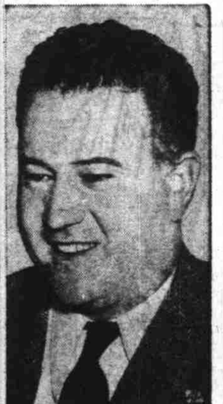
PLANS —Secret development of a $500,000 four-motored, 64-passenger, transport plane at Lockheed plant for 1942 delivery is announced by Jack Frye (above), TWA president, in collaboration with Howard Hughes. Top speed, 350 m.p.h.; range, 4,000 miles.