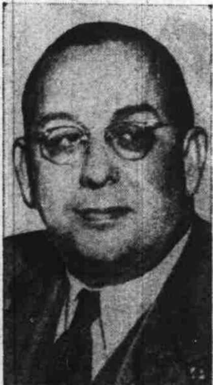
HELPS —Strikes don't worry Warden Joseph W. Sanford (above) of federal penitentiary at Atlanta where 1,000 prisoners boosted their production for defense—TNT bags, navy flying packs, ship awnings, shell covers—100 per cent in 30 days.