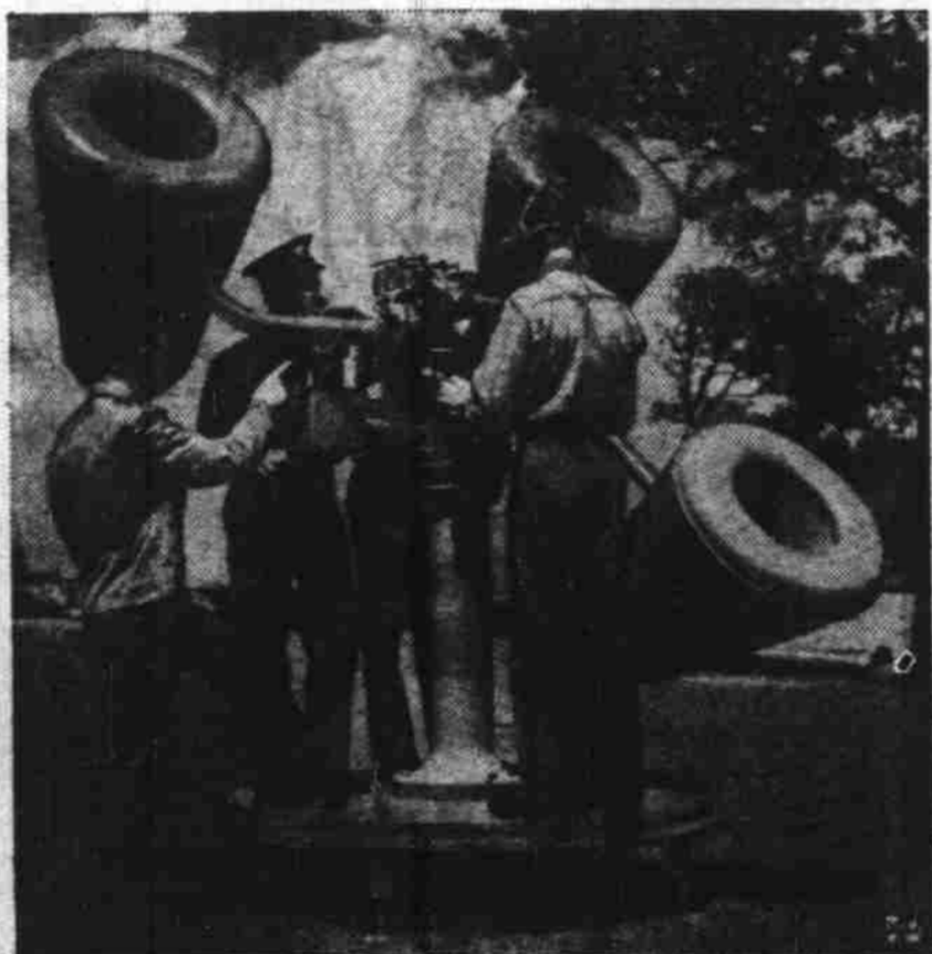
MY, WHAT LARGE EARS! —The better for hearing with, are the huge "ears" of this sound detector device on the grounds of West Point military academy where cadets are learning the stern theory of combating enemy aircraft.