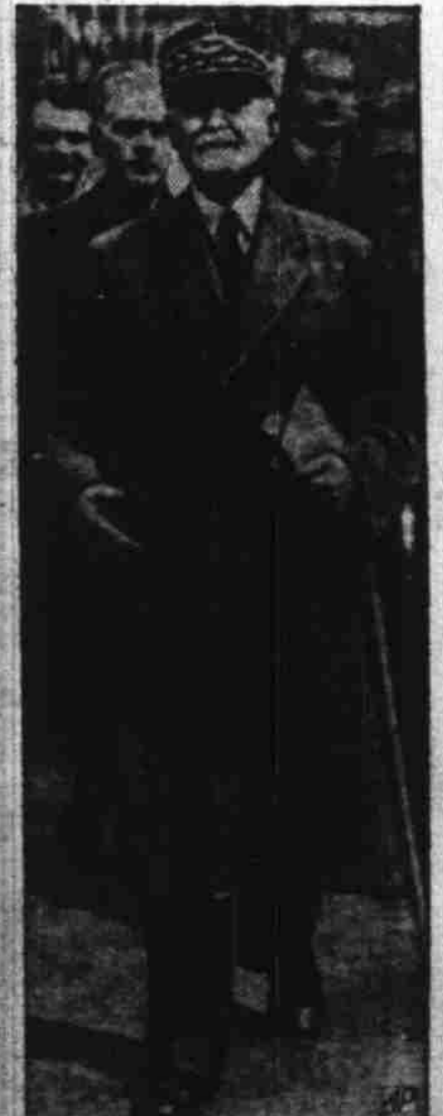
BOSS —At 35, Marshal Henri Philippe Petain (above) directs destiny of France. Recently he told his people "It is up to you to follow me without mental reservations."