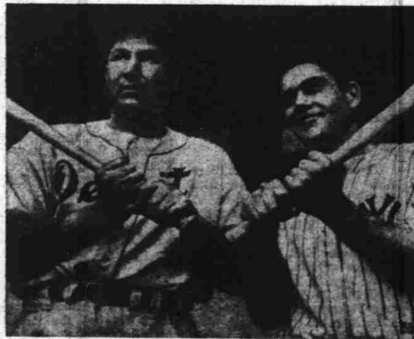
PAIR OF SLUGGERS —When these two, Rudy York (left) of the Detroit Tigers and Charlie Keller of the Yankees, met in New York recently they were even up on runs batted in—the tally for each being 27. The grips show how they do it.