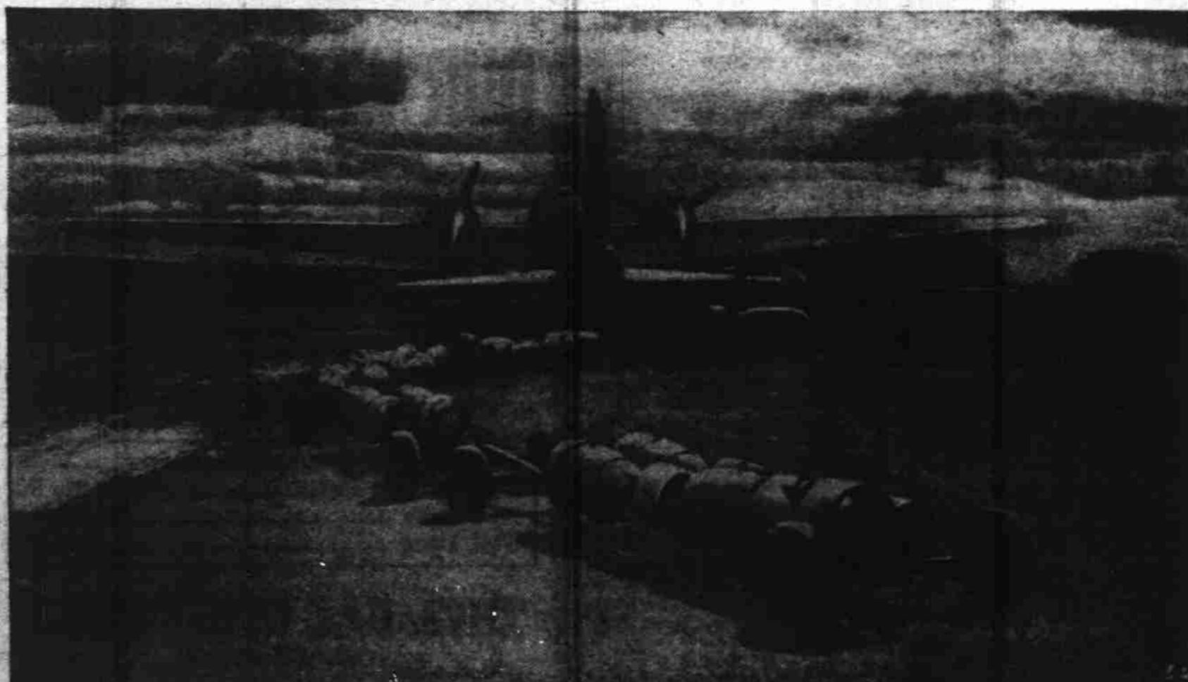
NEW TYPE TAIL FOR MARS KITE —Like the tail of a kite the bomb load of an R.A.F. night fighter in Britain curves behind a great war bird. This photo was made just as a night bomber squadron began its moonlight trip to Germany.