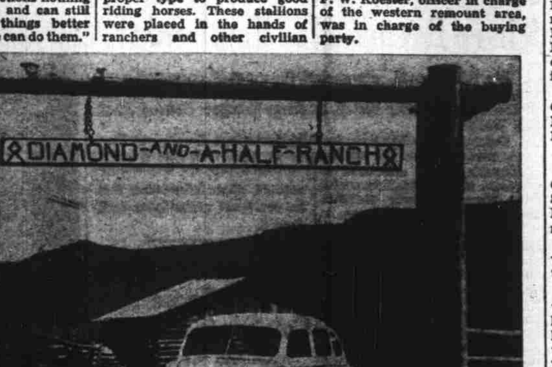
The Oregon State Motor association's familiar white car stops beneath the gateway of the famous Diamond-and-a-Half ranch in the Burnt river valley. The ranch is noted for horses,

The remount service has just completed a ten-day buying tour throughout eastern Oregon. Many excellent horses were acquired and immediately shipped to Fort Robinson, Nebraska, for conditioning and is-Under this plan the army has suance to various branches of the service. Lieutenant-Colonel proper type to produce good F. W. Koester, officer in charge riding horses. These stallions of the western remount area,