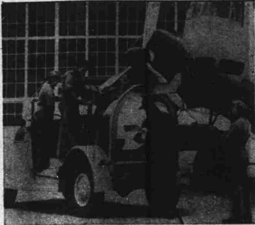
A familiar piece of motorized equipment around US army air corps bases these days is this new bomb service truck, shown being demonstrated near a giant US army bomber. Manufactured by the Ford Motor company, the special trucks are rigged with derrick and windlass to facilitate handling of bombs weighing from 600 to 1200 pounds. These trucks are used for towing bomb trailers or carrying bombs such as the 600-pounder shown above, from storage points to the airplane.