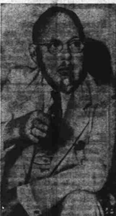
CANDIDATE —Dr. John Brinkley (above), gland surgeon, has jumped into Texas' free-for-all U.S. Senate race. He seeks secret support by the death of Morris Sheppard.