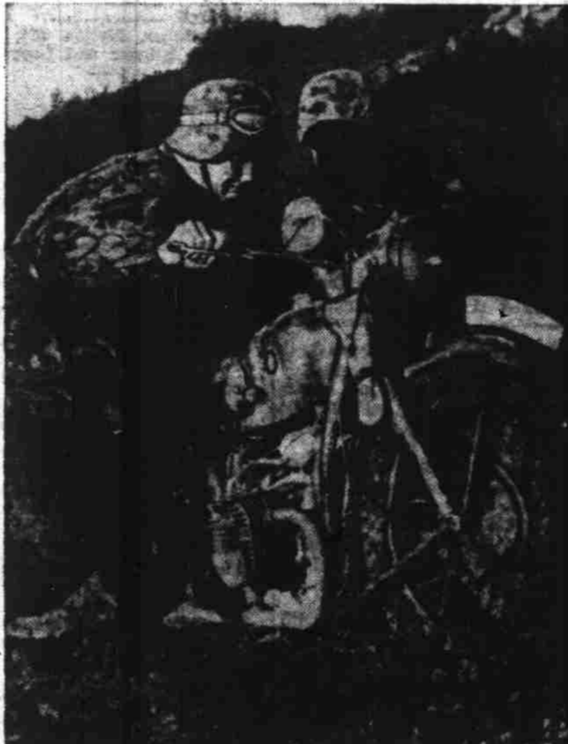
BLITZ BOGGED —Serbian mud slowed this camouflaged Nazi blitzkrieger. Identification plate on cycle has been censored.