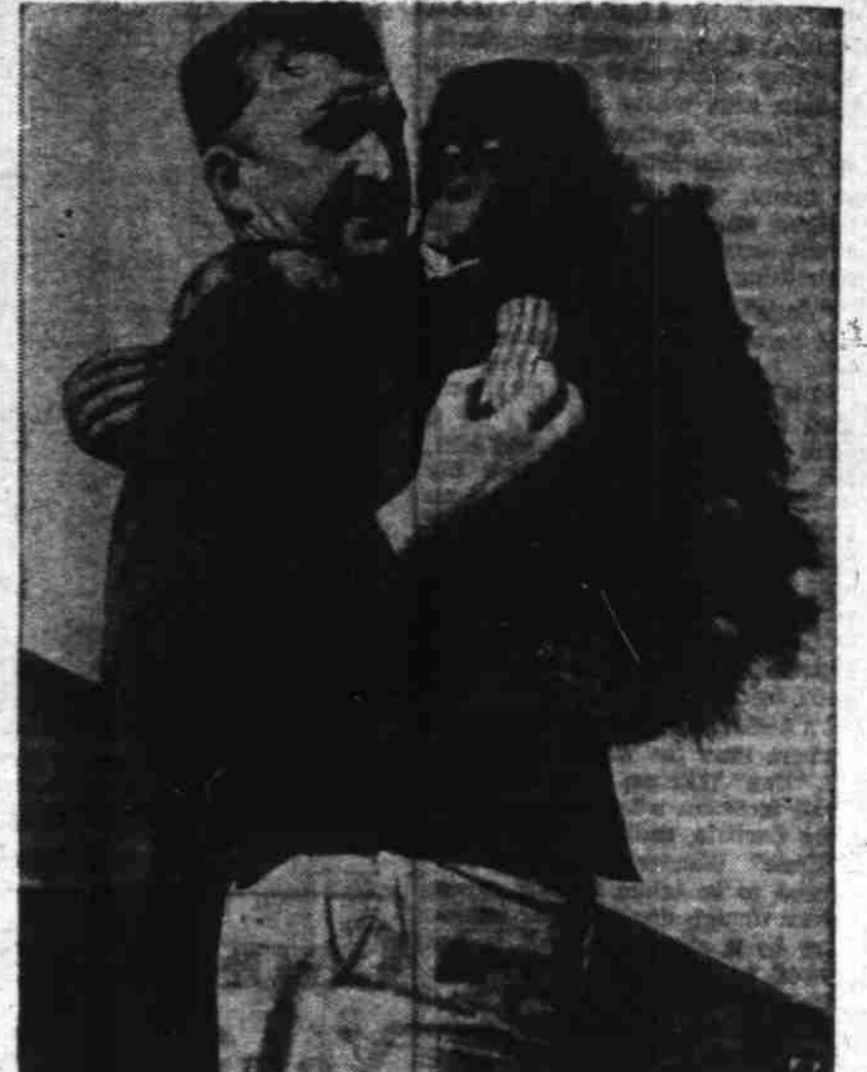
NUTTY CELEBRATION —Ko Ko, San Diego orang-utang, gets bag of nuts, not cake, on fifth birthday from trainer.