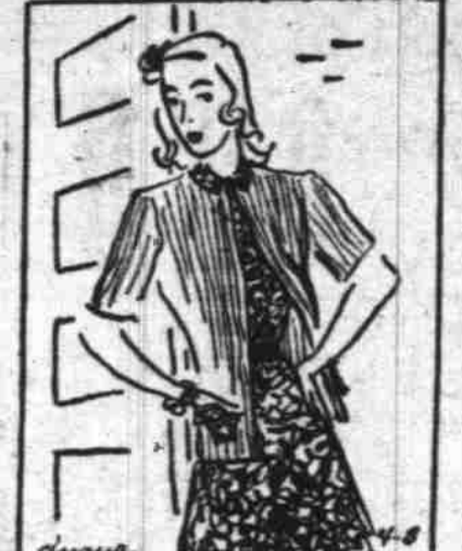
By Dolores Boland

It's About Time to make a sweater to wear with your spring print dress. Use yarn the color of background of print. With dress material make double pockets and collar. Baste these on to simplify laundering.