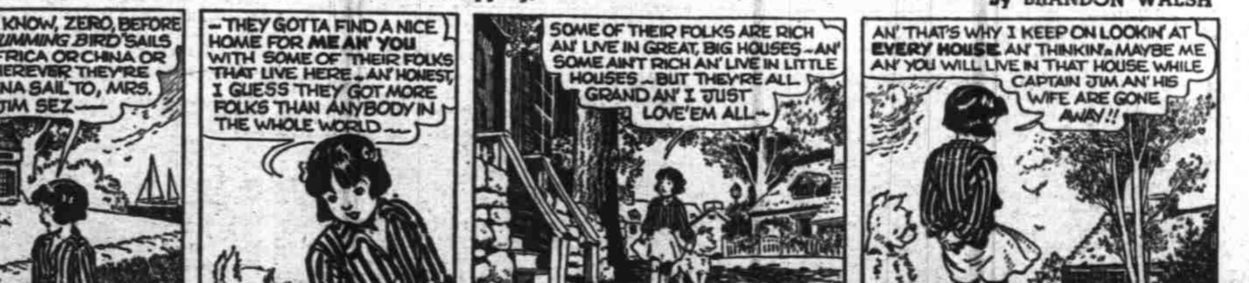
LITTLE ANNIE ROONEY Window Shopping! By BRANDON WALSH