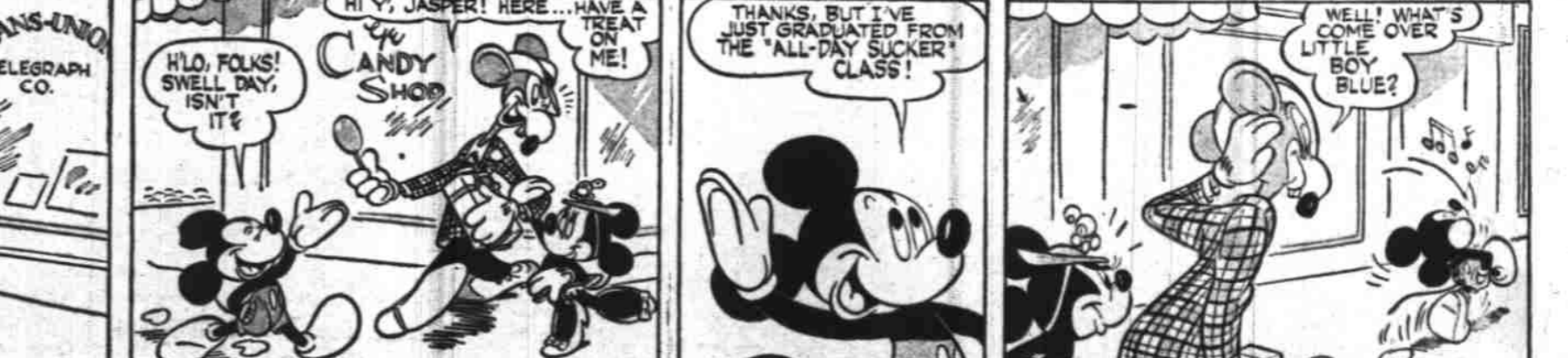
MICKEY MOUSE The Candy Kid By WALT DISNEY