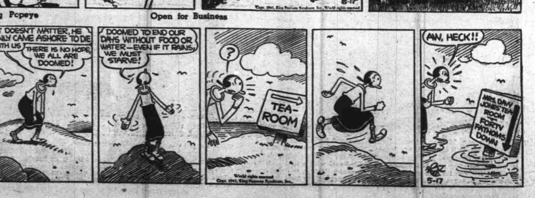
THIMBLE THEATRE—Starring Peepys Open for Business