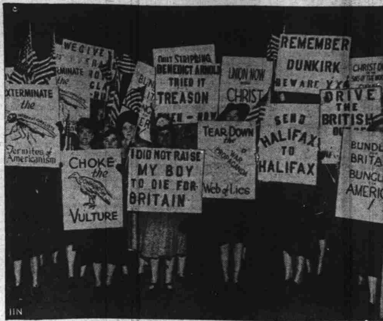
While Lord Halifax, the British ambassador, spoke inside, this group of women, representing various organizations to keep the U. S. out of war, paraded outside a Chicago hotel, carrying the banners pictured. In his speech, the first he made on a seven-day tour of the midwest, the British envoy said that Germany's domination of 164,000,000 people "carries within it the seeds of its own destruction."