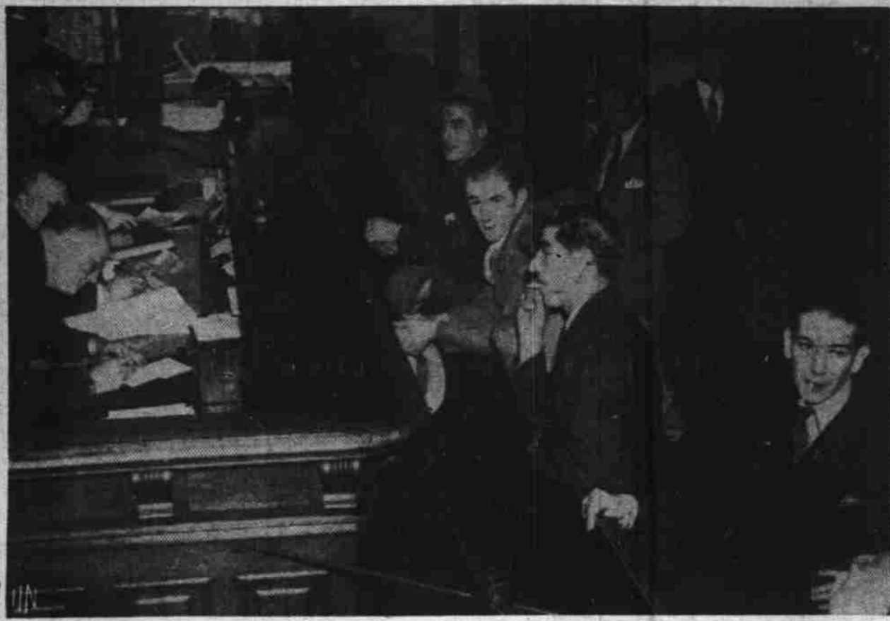
A few of the Italian aliens, most of them waiters, who were rounded up by Federal immigration inspectors in New York, are shown in a police station. They were all charged with overstaying their permits to remain in the U. S. Warrants were issued for more than a hundred.