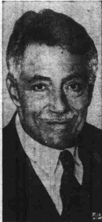
IMPROVING —Fritz Kreisler, 66 (above), renowned violinist who suffered a skull fracture in a New York traffic accident, is improving. He was a captain in the Austrian army during the first World War.