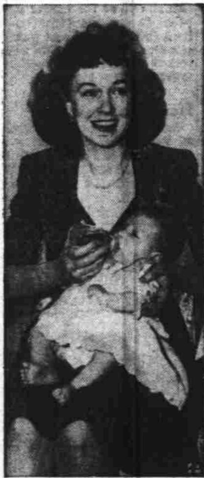
STAR —Dorothy Comingore, film star, is more concerned about her infant, whom she's feeding, than her own career.