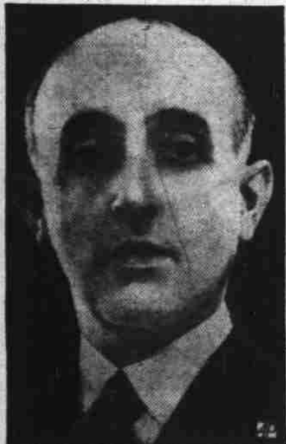
SUGGESTION —A "suggestion box" government is being tried by President Manuel Prado of Peru (above). People make proposals, agency studies their practicability.