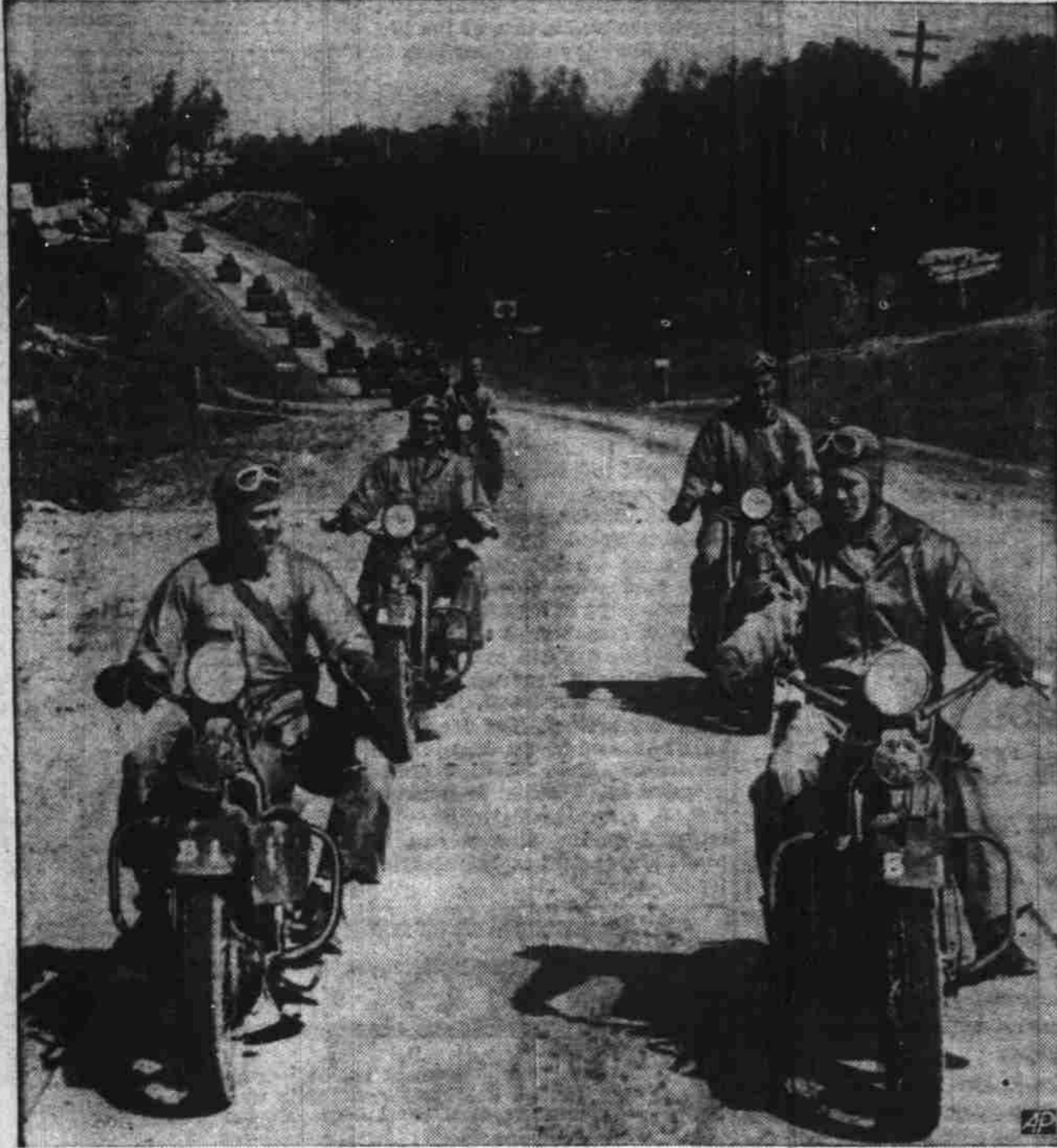
SEASONING TRIP —Led by motorcycles, the first armored brigade of the first armored division moves along a highway from Fort Knox, Ky., to Mammoth Cave, Ky., during a seasoning trip.