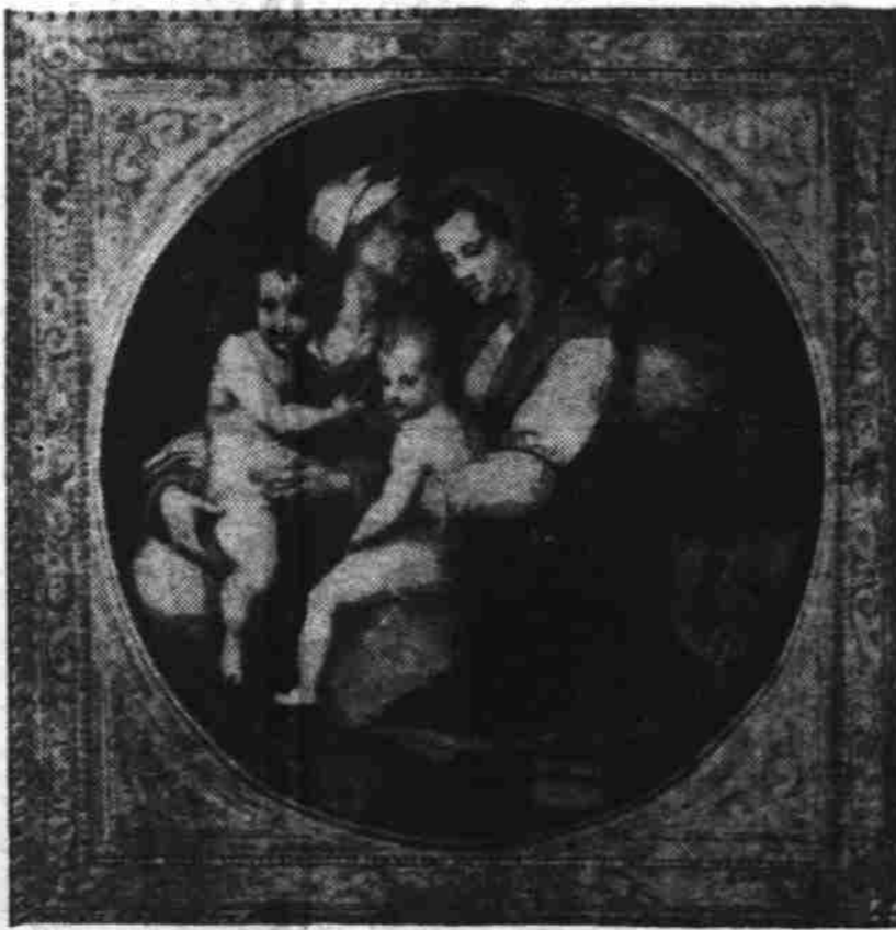
MASTERPIECE TO CATHEDRAL —This 1515 Italian masterpiece by Andrea del Sarto, entitled "Holy Family," has been presented to St. Patrick's Cathedral in N. Y., by Major Edward Bowes. Its reported value, $151,000.