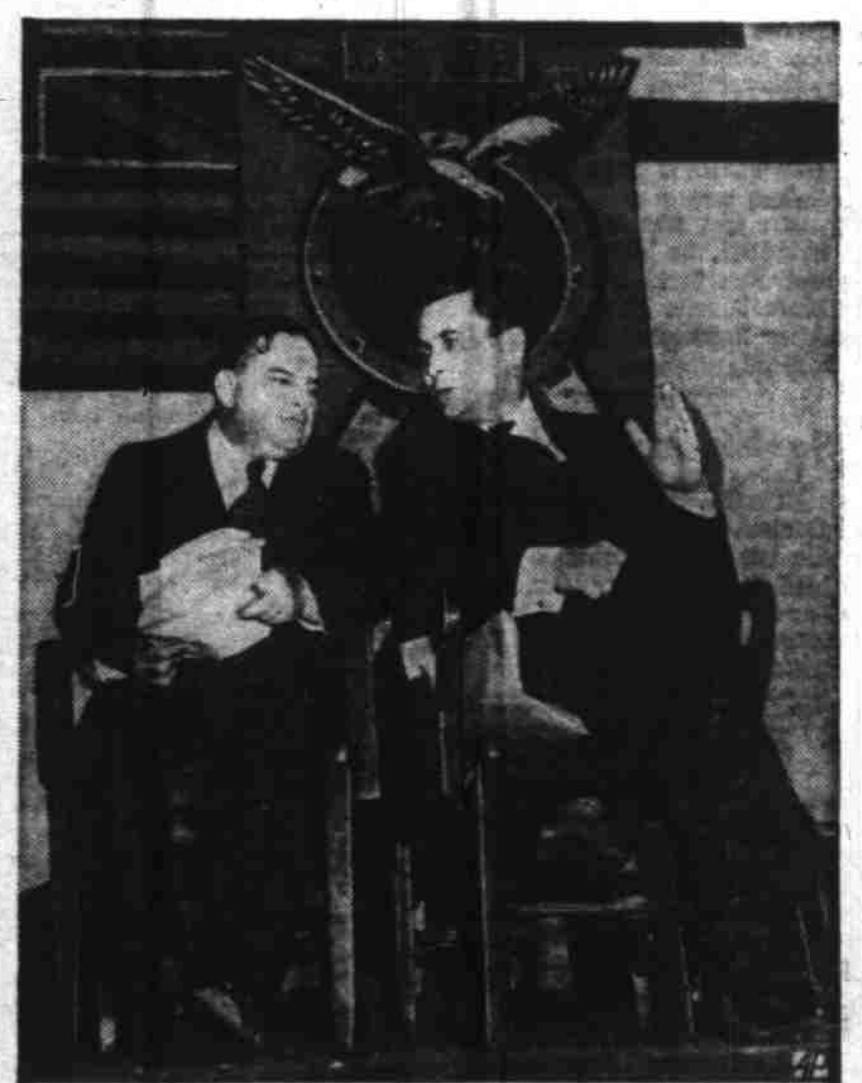
STRESS AND STRAIN —His brows knit but feet cuddled like those of a little boy, New York's Mayor F. E. LaGuardia listens intently as Wendell L. Willkie stresses a point at a Freedom Rally they both addressed in New York.