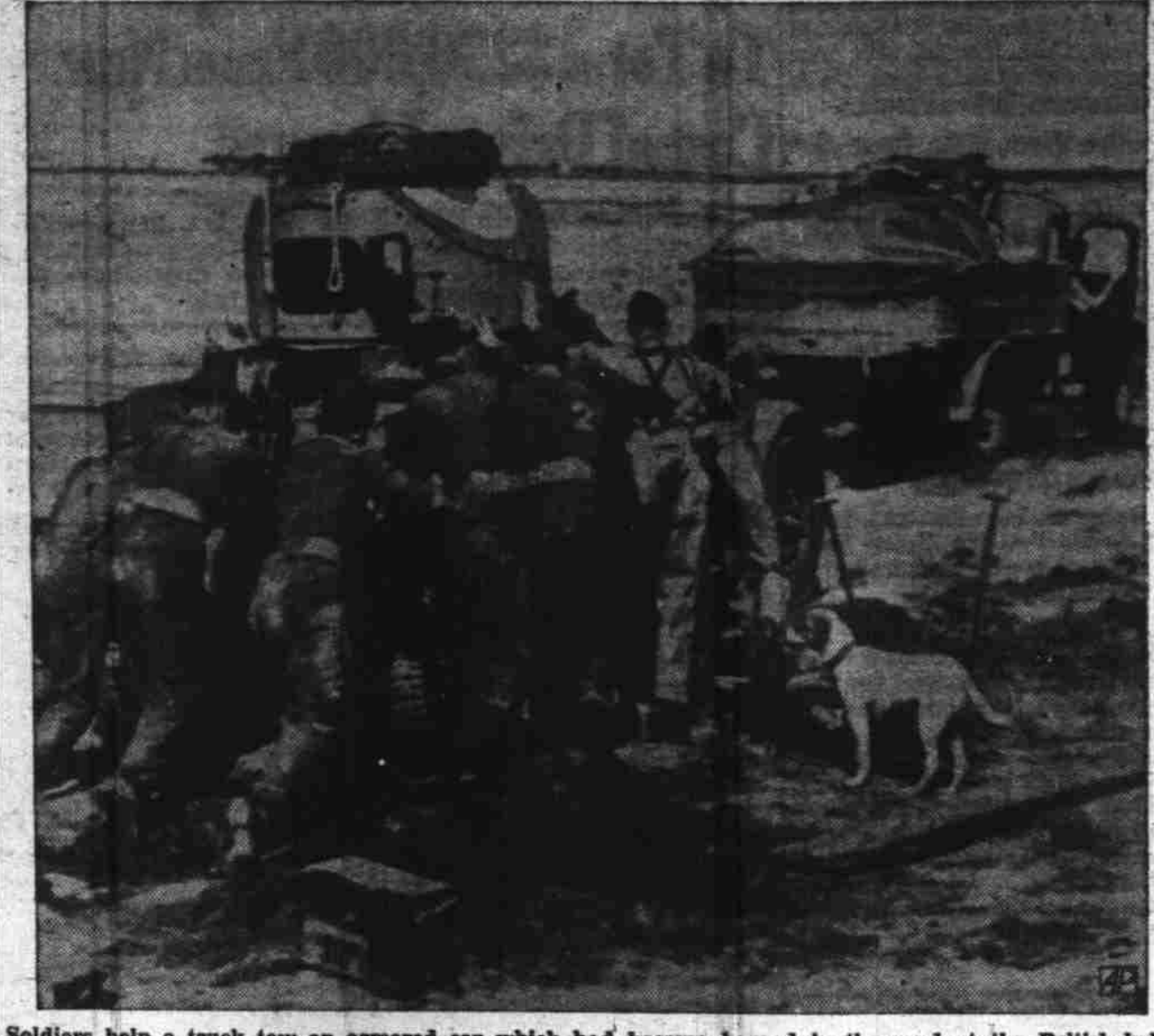
Soldiers help a truck tow an armored car which had become bogged in the sand at the British-held Habbaniyah airport in Iraq, 60 miles west of Baghdad. Fighting at the airport between British and Iraq troops has virtually ceased, late reports indicate.