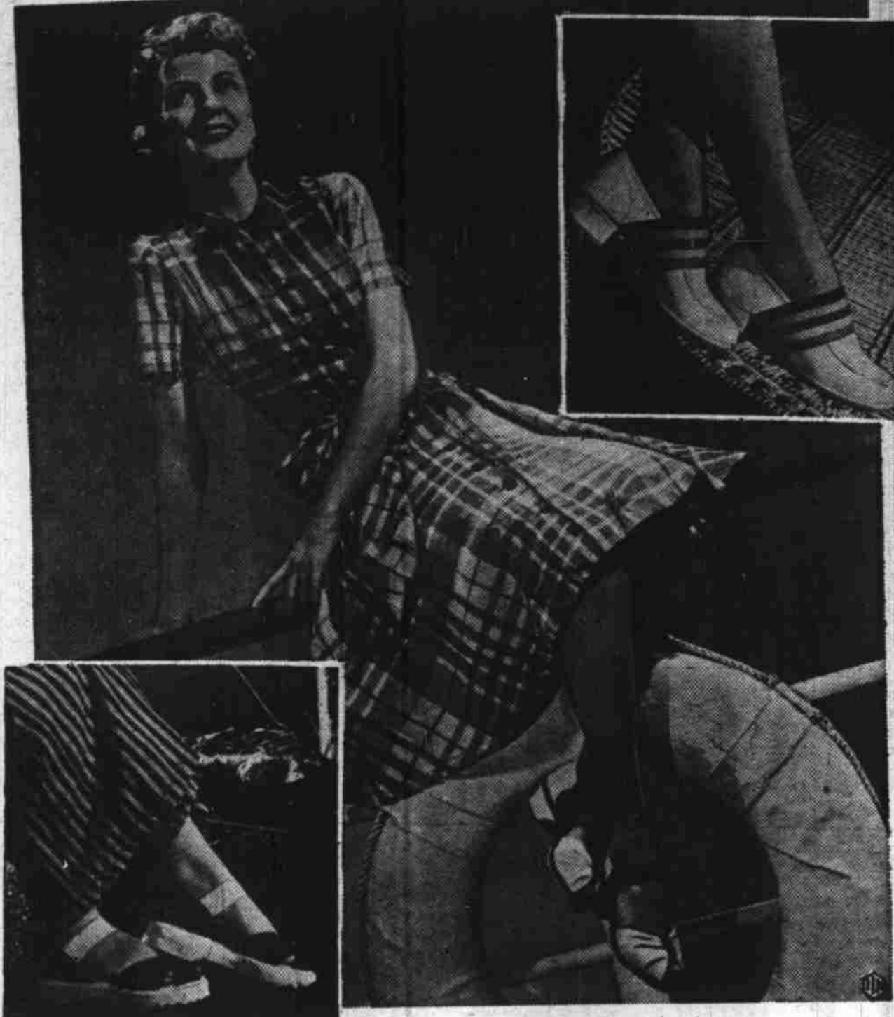
Lower left, barefoot sandal; center, strap sandal; top right, strap moccasin

Today American women value their freedom as never before. Even clothes and shoes are designed for freedom and comfort, leaving the wearer free to work and play. This season there is the widest variety in shoes. There are styles to suit every age, taste and need. Colors include scarlets, golds, soft greens and many different tones of blue, so with a basic dress you can get different costume effects just by changing the color of your shoes, belt and kerchief. The barefoot sandal, lower left, is to wear with slacks, shorts or bathing suits. It is made with a thick cork sole and put together with rubber milk. The uppers are soft cotton which is washable. The young woman in the center is wearing strap sandals that may be worn for town as well as on shipboard. The strap moccasin, top right, flatter the feet and are made with walled toe, college heel and distinctive band of laces, that comes in multi-color, dark blue or brown.