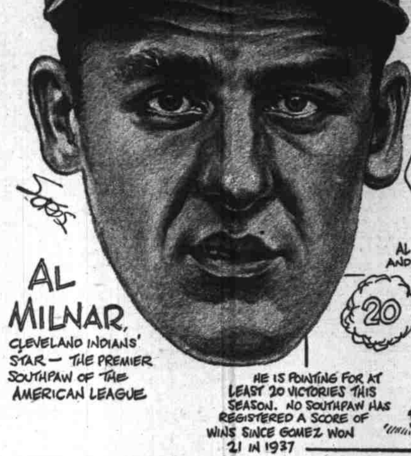
AL MILNAR, CLEVELAND INDIANS' STAR - THE PREMIER SOUTHPAW OF THE AMERICAN LEAGUE

HE IS POINTING FOR AT LEAST 20 VICTORIES THIS SEASON. NO SOUTHPAW HAS REGISTERED A SCORE OF WINS SINCE GOMEZ WON 21 IN 1937