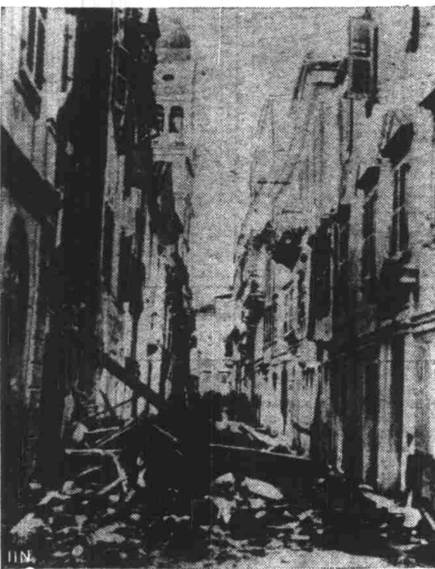
View of bomb wreckage in Corfu, Greece

Target of Italian bombing planes, the centuries-old Greek seaport city of Corfu, on the island of Corfu, largest of the Ionian islands in the Mediterranean, is littered with wreckage today following the aerial attack. Corfu has dark, narrow streets, and its buildings, many of them with arcades, bear witness to the centuries of Venetian rule.